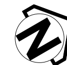
1 MECHANICAL HVAC PLAN 1 : 50