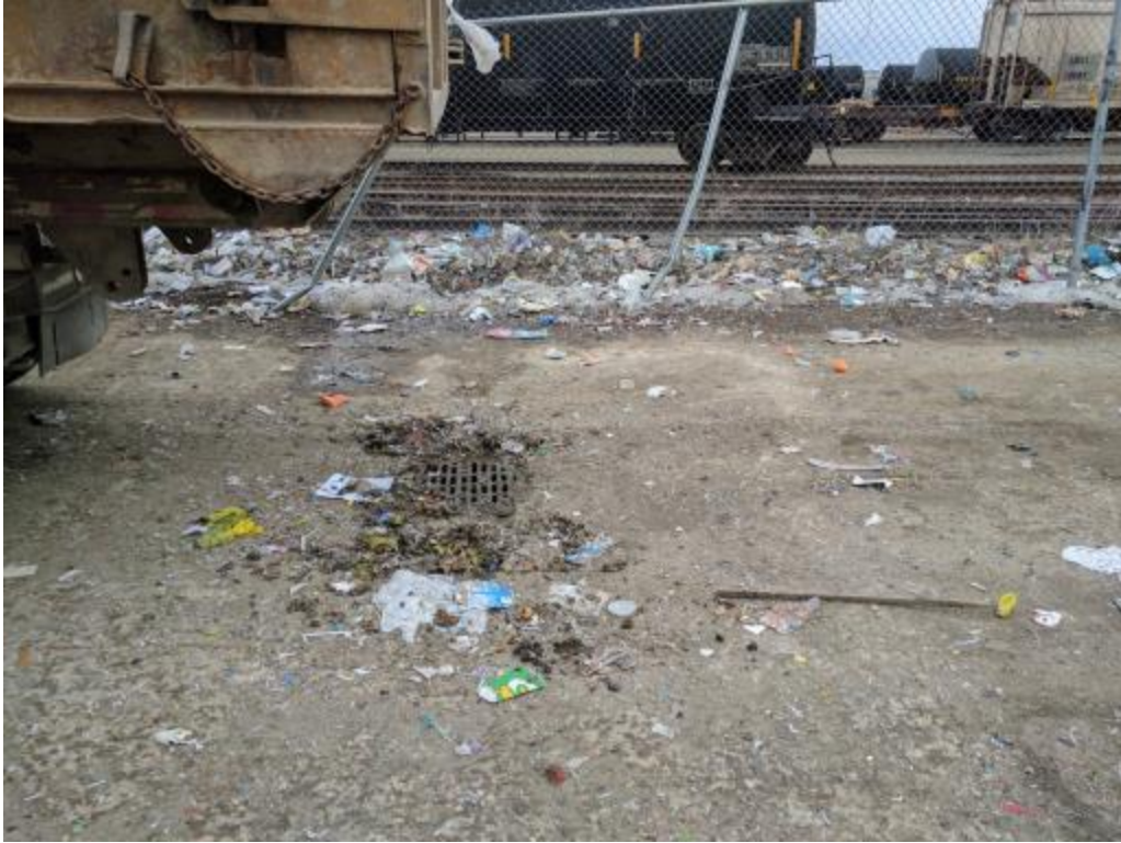
Figure 5 - MH20017732 (Higgins Av) - General Location (2)