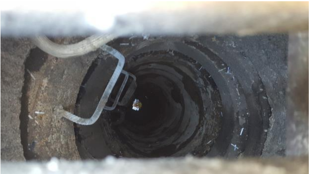
Figure 8 - MH20017744 (Higgins Av) - Riser Condition Requiring Stabilization