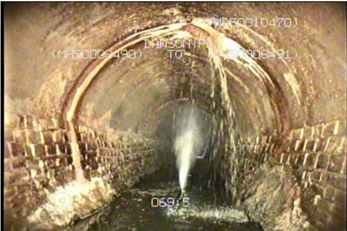
Figure 16 - S-MA50010470 (Dawson Rd) - General Condition w/ Encrusted Service Connection