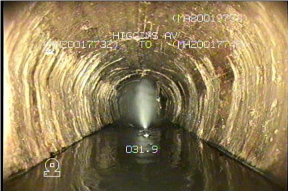
Figure 11 - S-MA20019733 (Higgins Av) - General Condition