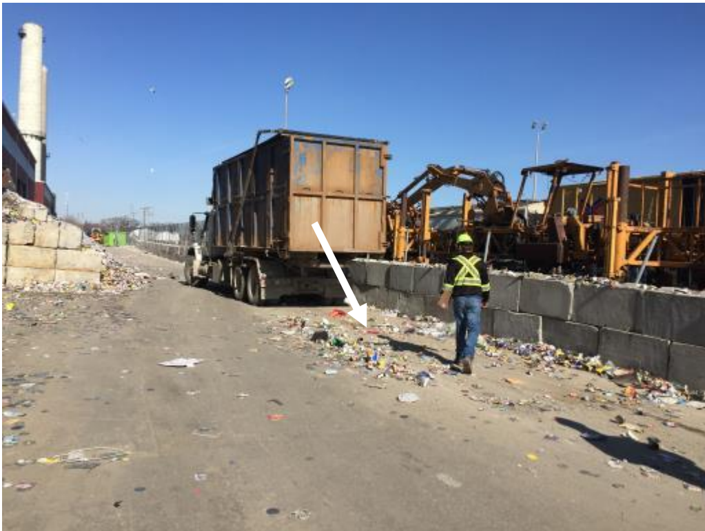
Figure 6 - MH20017745 (Higgins Av) - General Location