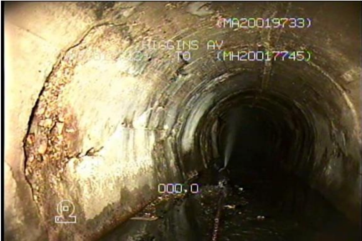
Figure 9 - S-MA20019733 (Higgins Av) - General Condition w/ Spalling