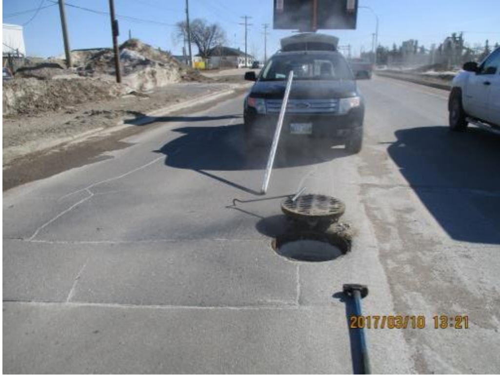
Figure 1 - MH50008490 (Dawson Rd) - General Location