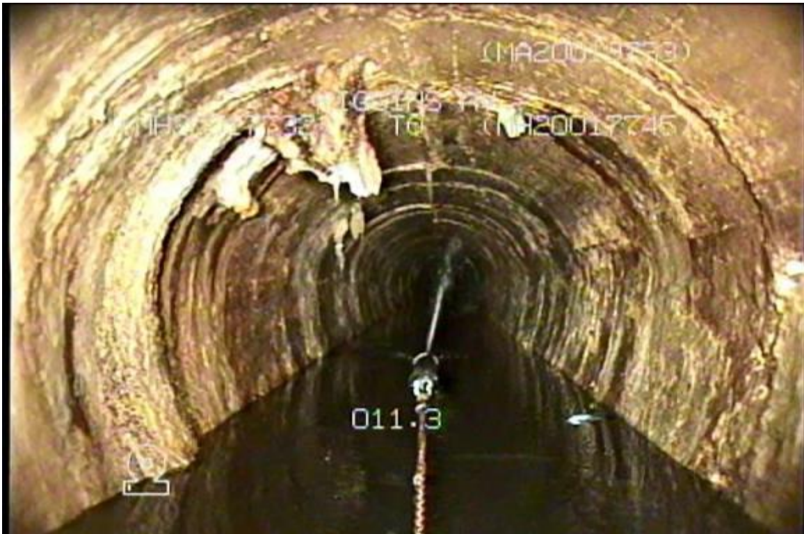
Figure 10 - S-MA20019733 (Higgins Av) - General Condition w/ Encrusted Service Connection