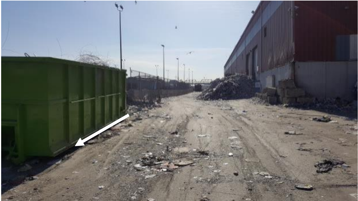
Figure 4 - MH20017732 (Higgins Av) - General Location (1)