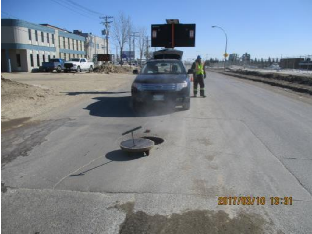
Figure 3 - MH50008491 (Dawson Rd) - General Location