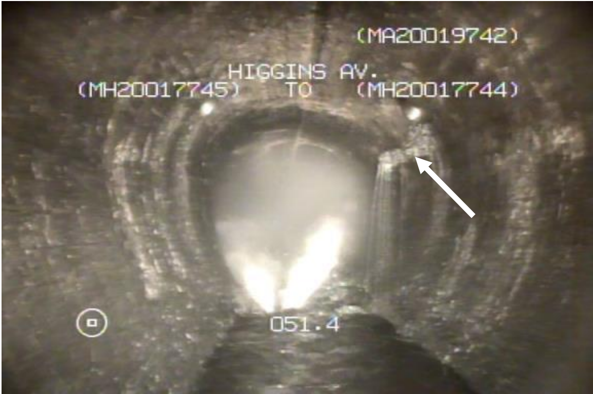
Figure 13 - S-MA20019742 (Higgins Av) - General Condition w/ Encrusted Service Connection