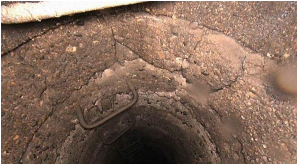
Figure 2 - MH50008490 (Dawson Rd) - Riser Condition Requiring Stabilization