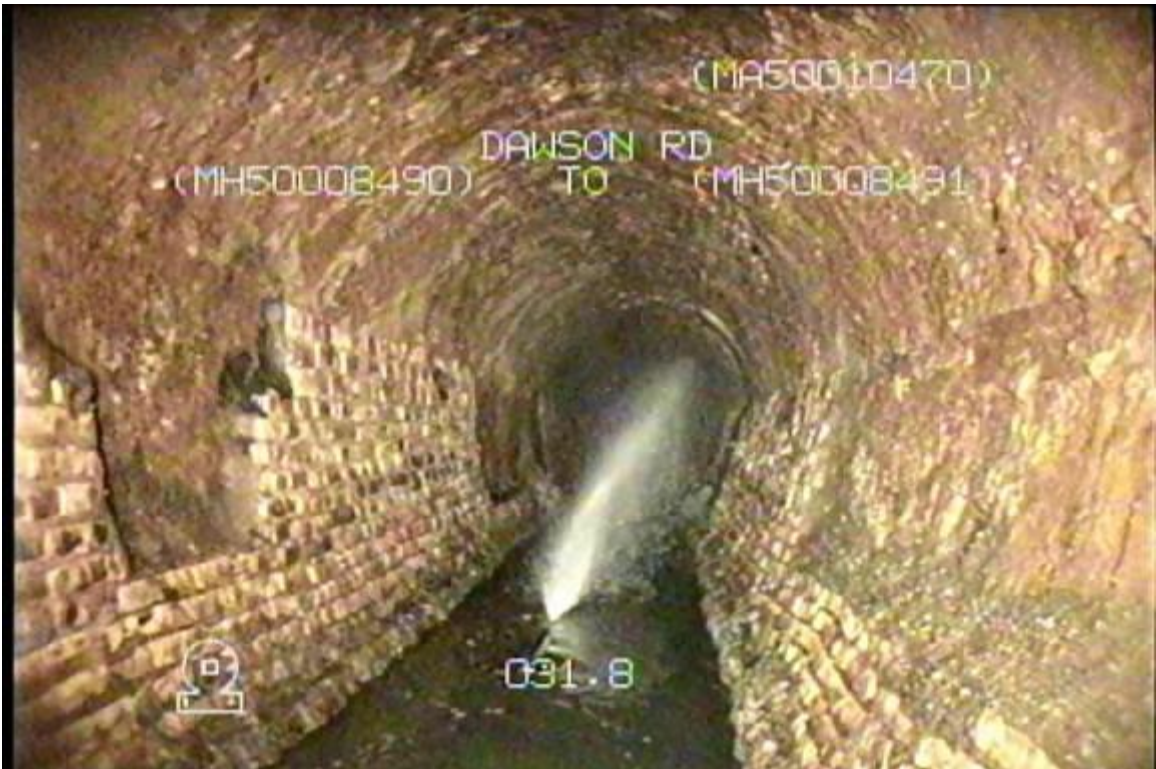
Figure 14 - S-MA50010470 (Dawson Rd) - General Condition