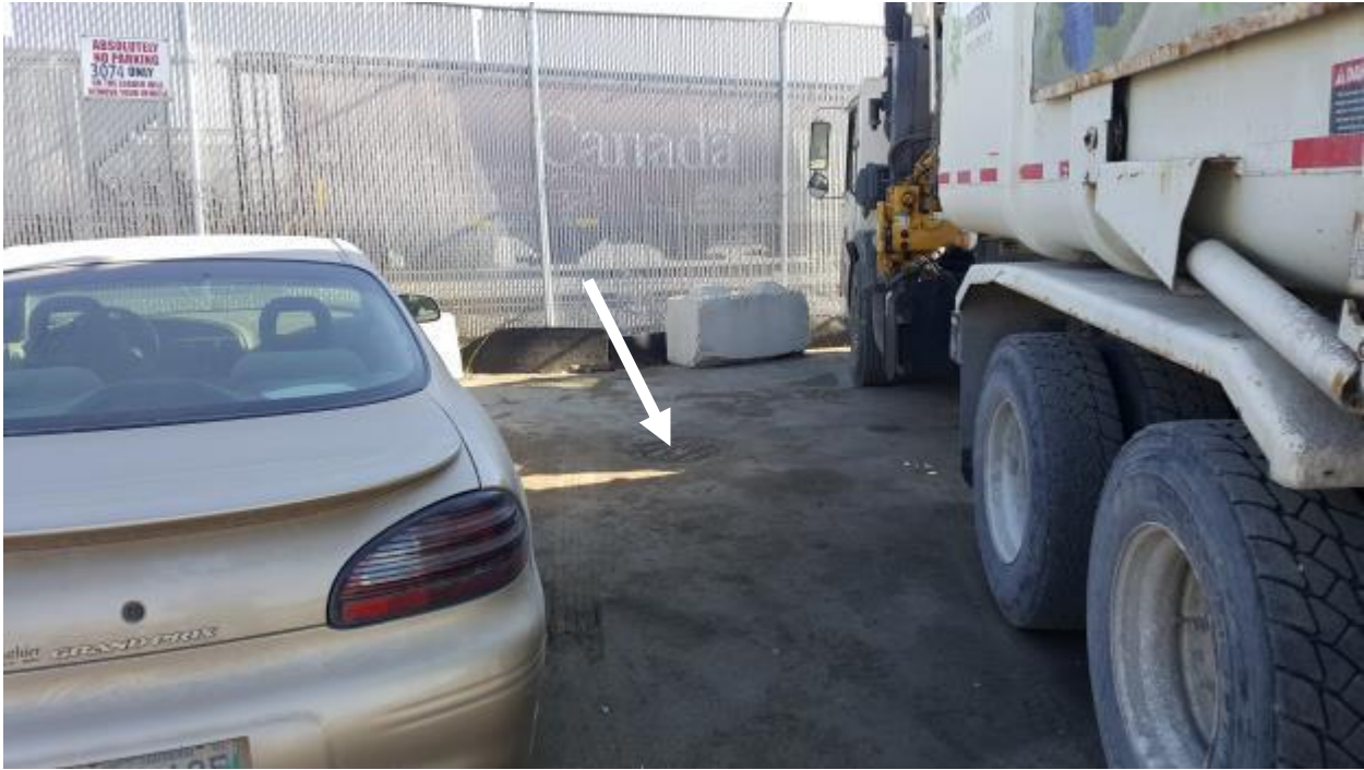
Figure 7 - MH20017744 (Higgins Av) - General Location