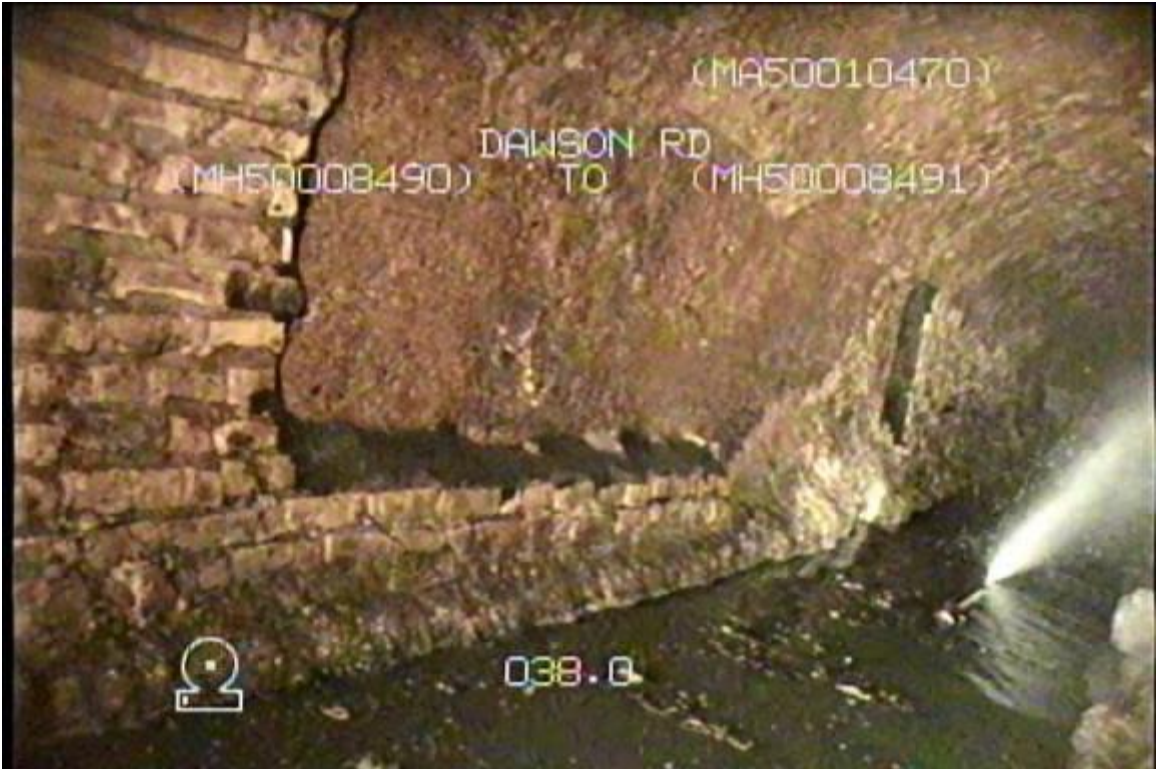
Figure 15 - S-MA50010470 (Dawson Rd) – Missing Section of Existing Brick Invert Liner