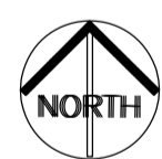
1 SITE PLAN - LANDSCAPING SCALE: 1:500