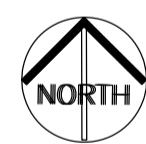
PARTIAL SITE PLAN - BUILDING LOCATION SCALE: N.T.S.