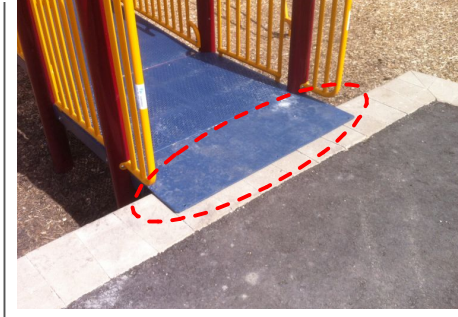
RAMP to WALL CONNECTION SEE DRAWING W.31-K FOR DETAILS