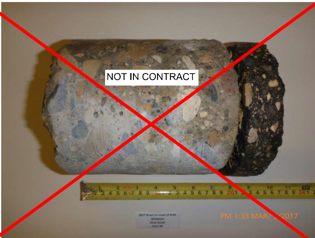
Photograph 6: Test Hole TH17-06 - Olive Street