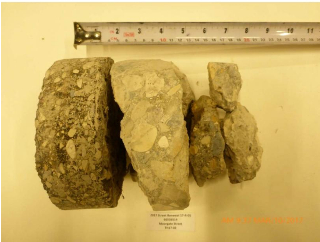
Photograph 2: Test Hole TH17-02 - Moorgate Street