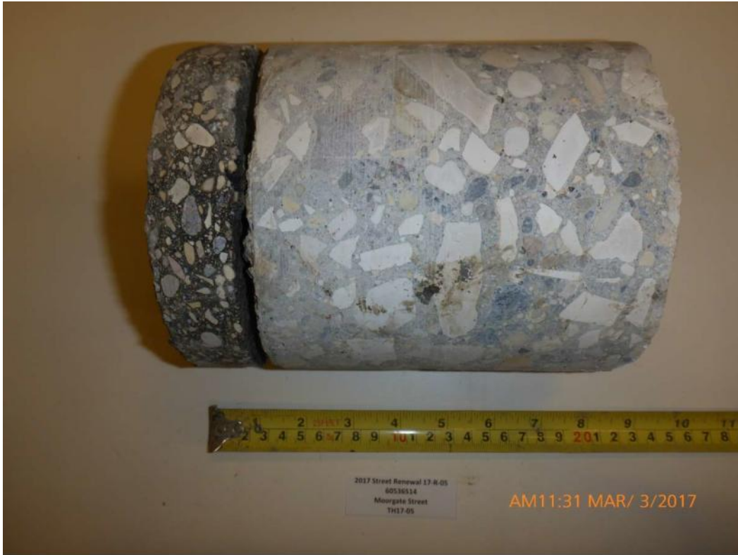
Photograph 5: Test Hole TH17-05 - Moorgate Street