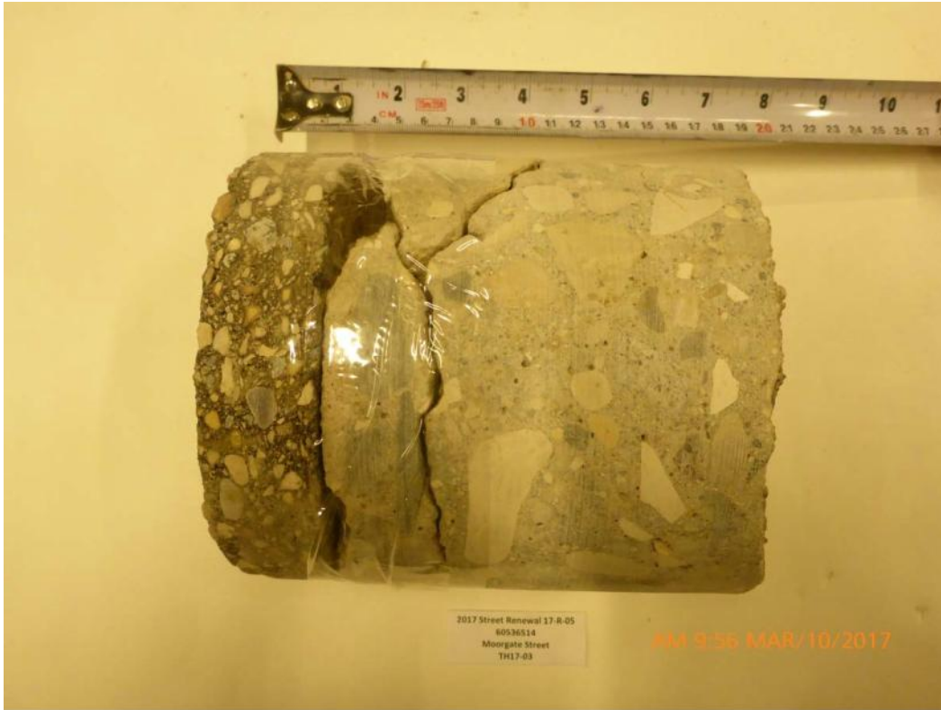
Photograph 3: Test Hole TH17-03 - Moorgate Street