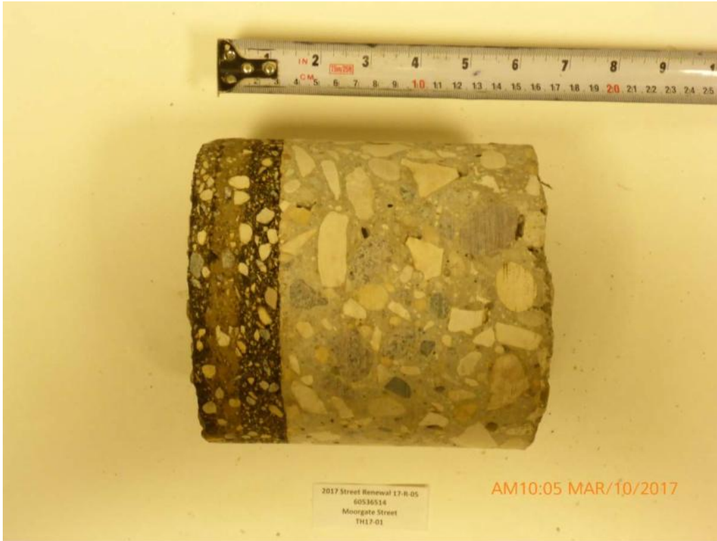
Photograph 1: Test Hole TH17-01 - Moorgate Street