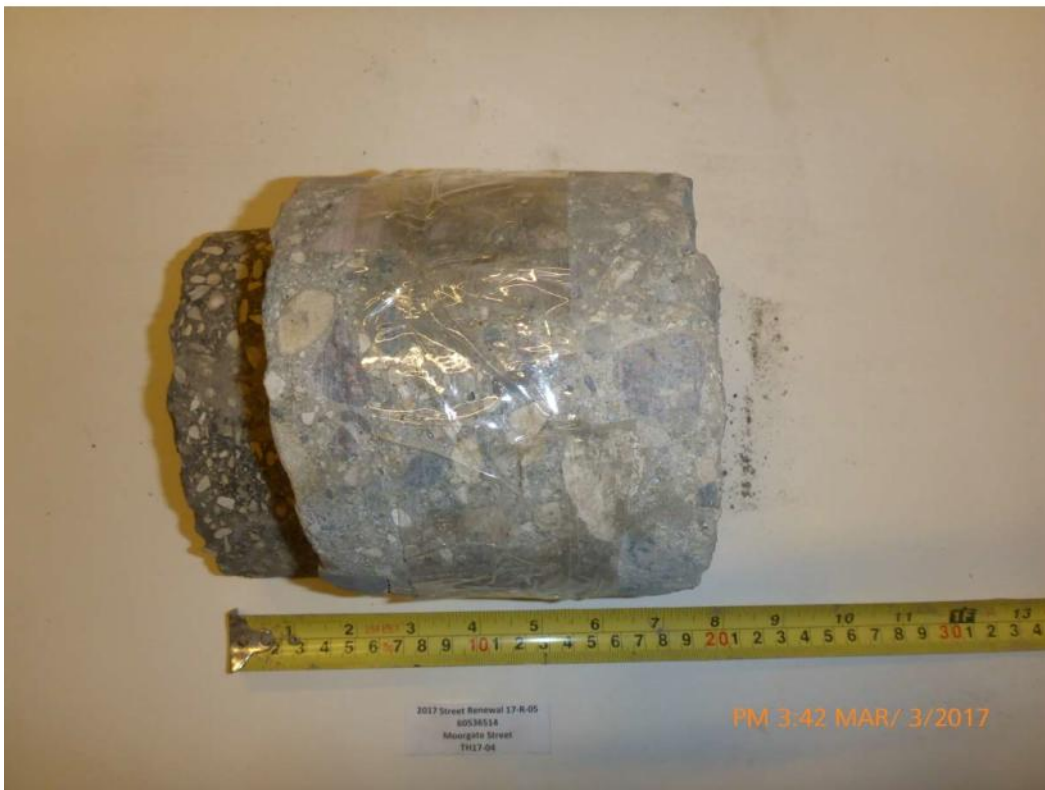
Photograph 4: Test Hole TH17-04 - Moorgate Street