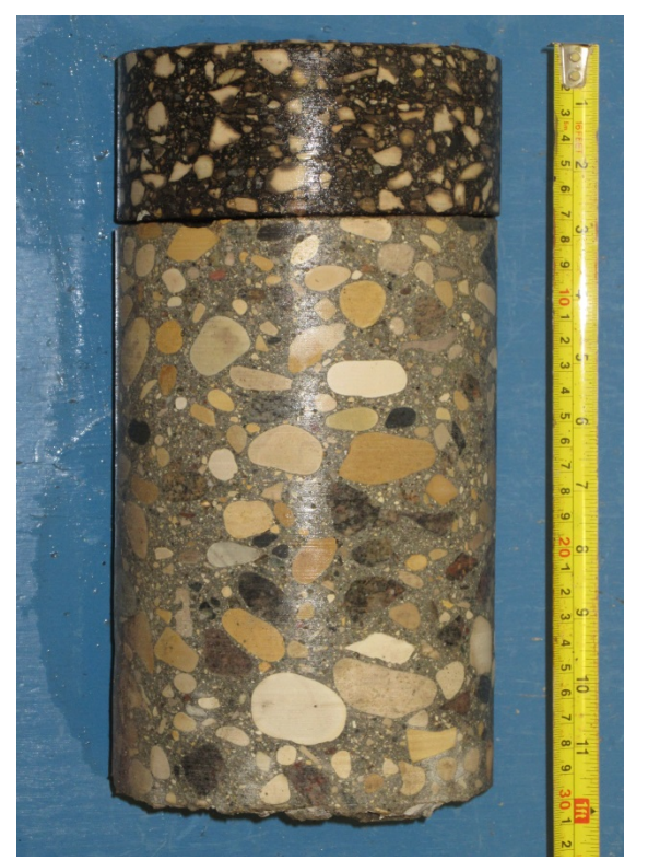
Core no. 3