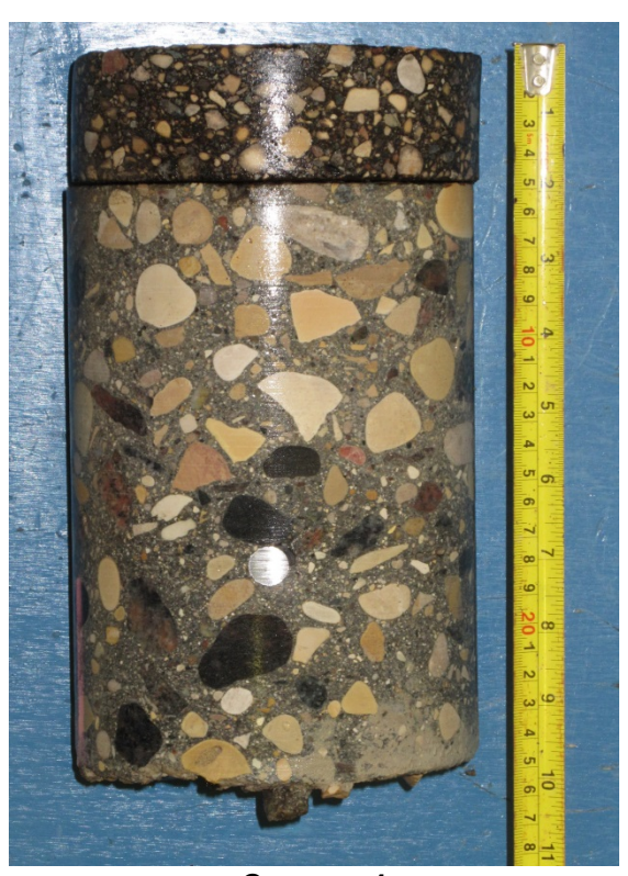
Core no. 4