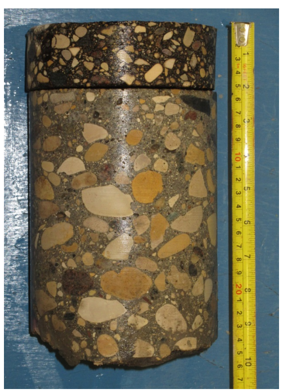
Core no. 8