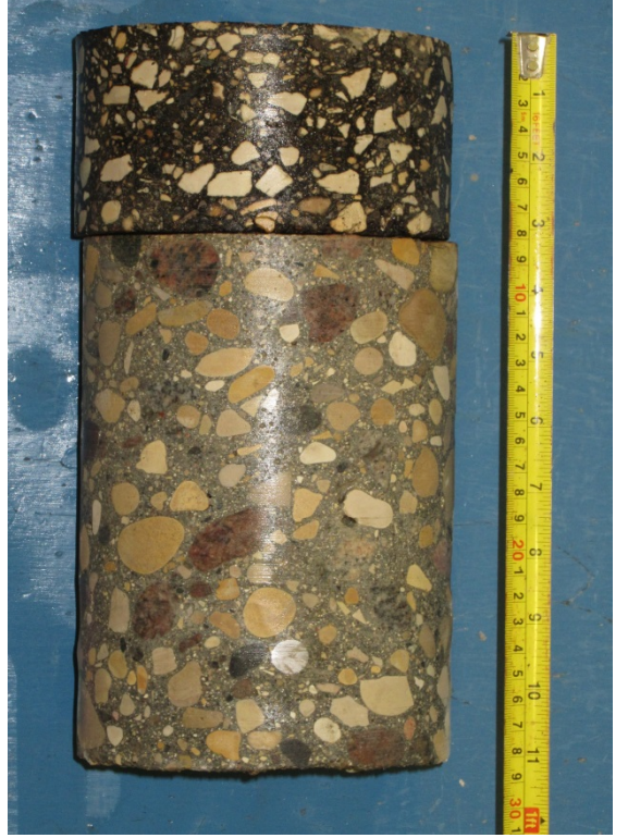
Core no. 7