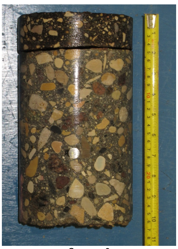
Core no. 2