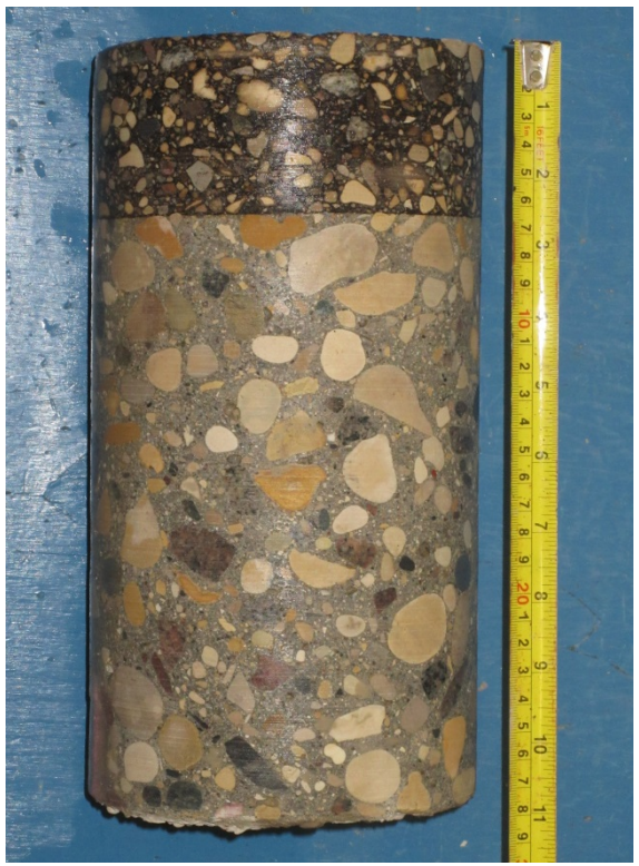
ore no. 9 Core no. 10