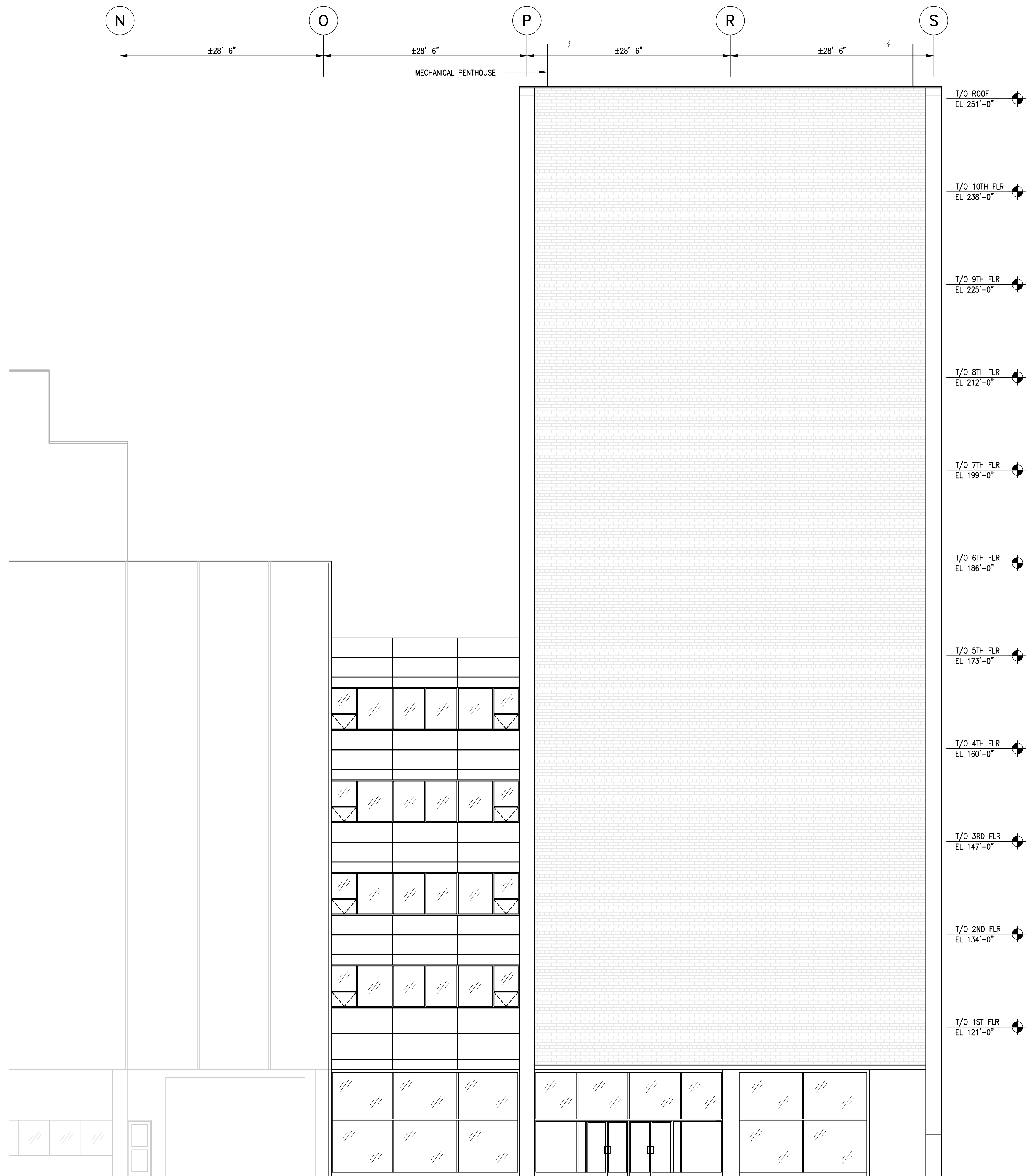
1 EAST ELEVATION S1.4 1/8" = 1'-0"