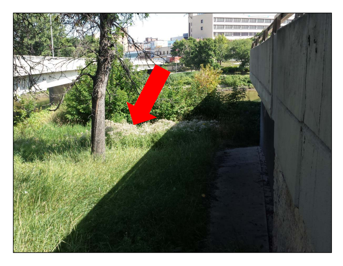
Figure 20 – Site access, facing northeast.