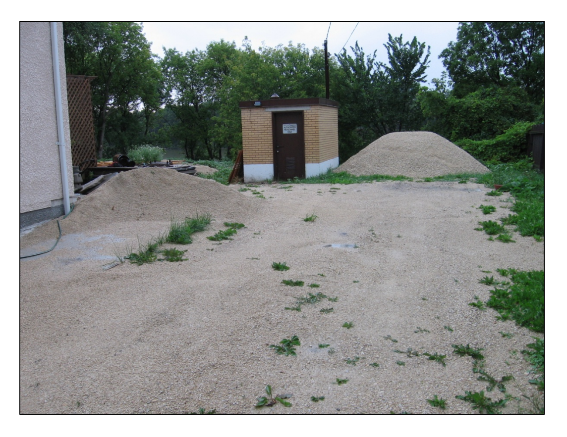
Figure 2 – Pump Station, facing west.