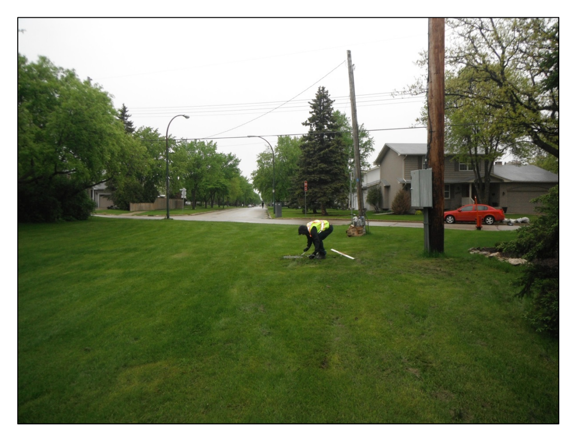
Figure 10 – Chamber location off Assiniboine Avenue, facing north.