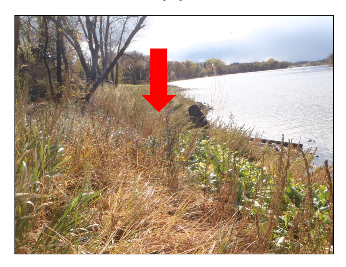
Figure 3 – River bank, facing south.