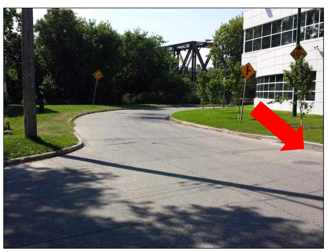
Figure 21 – Site access on St. James Street at Wolseley Avenue West, facing southwest.