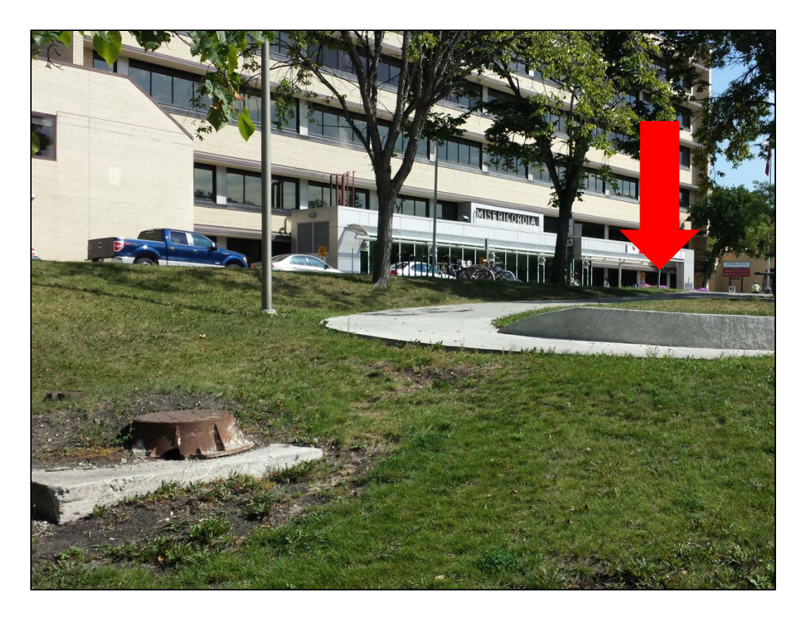
Figure 16 – Site access, facing northeast.