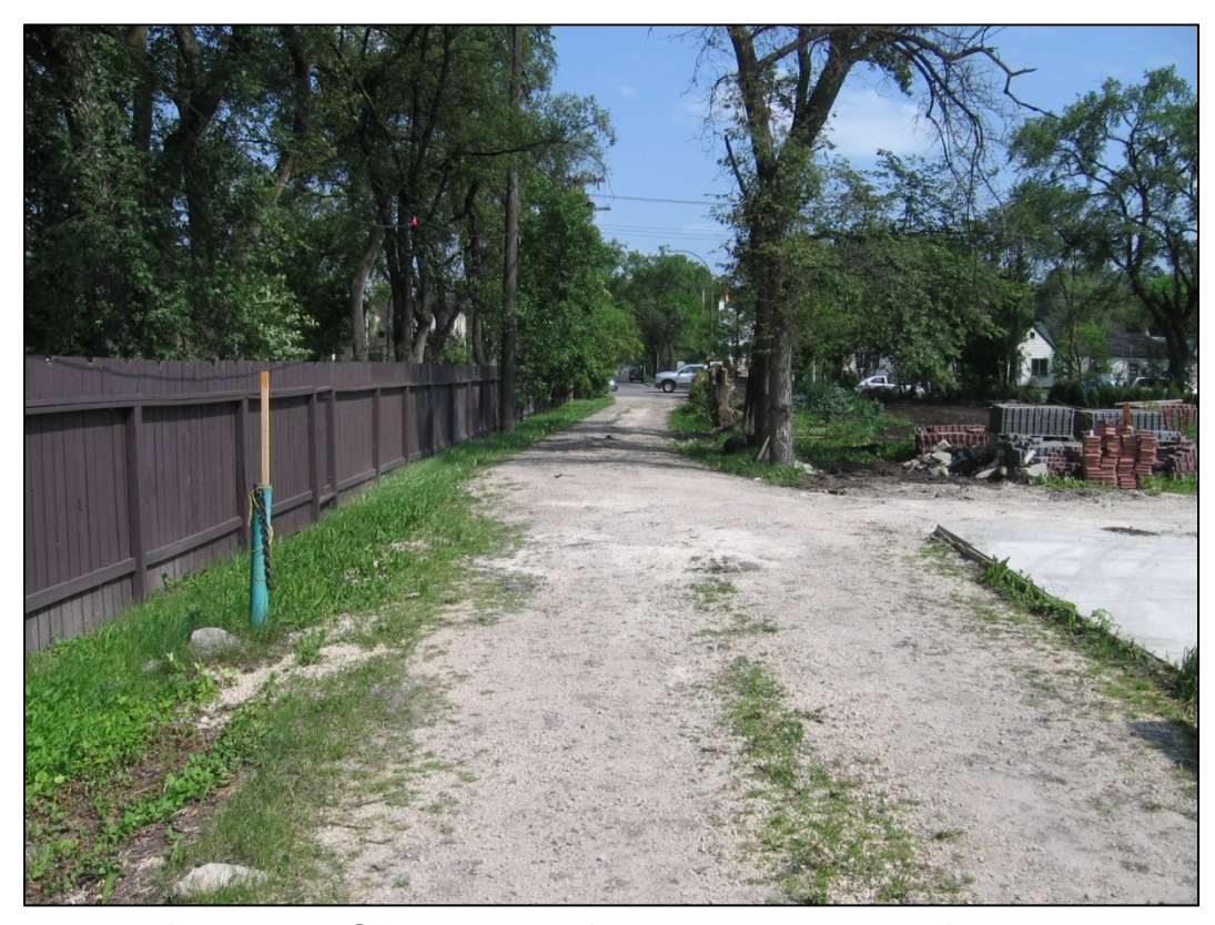
Figure 1 – Site access from Henderson Highway at Munroe Avenue, facing east.