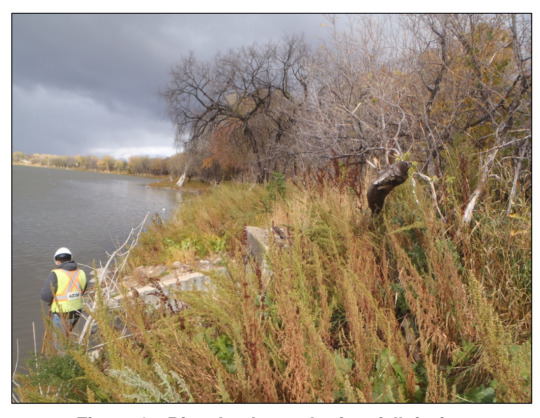
Figure 4 – River bank, south of outfall, facing north.