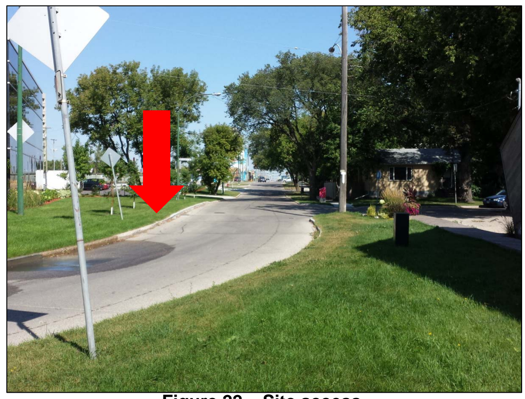
Figure 22 – Site access, On St. James Street at Wolseley Avenue West, facing north.