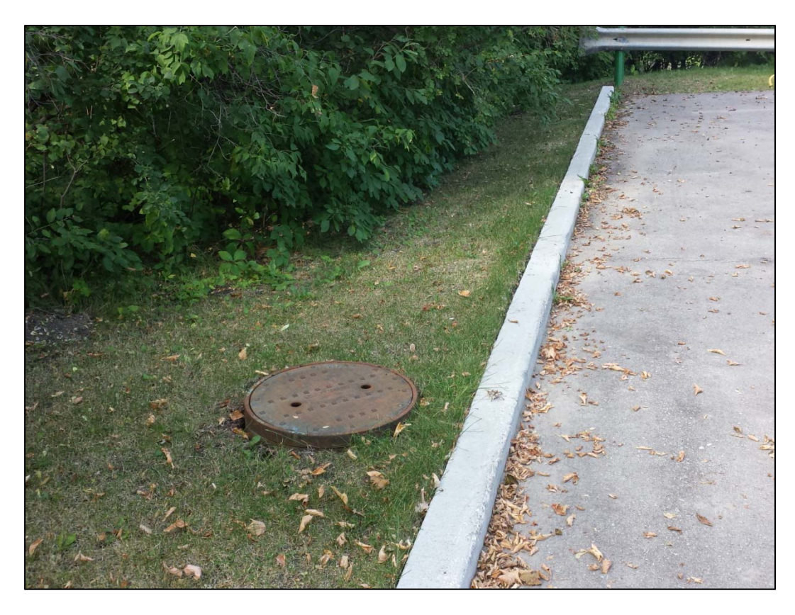
Figure 14 – Existing valve chamber.