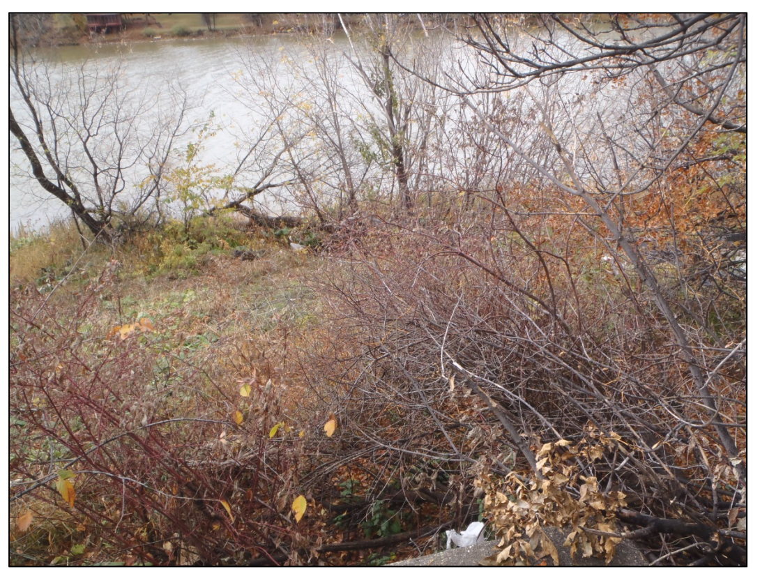
Figure 5 – Standing on the valve chamber, looking west.