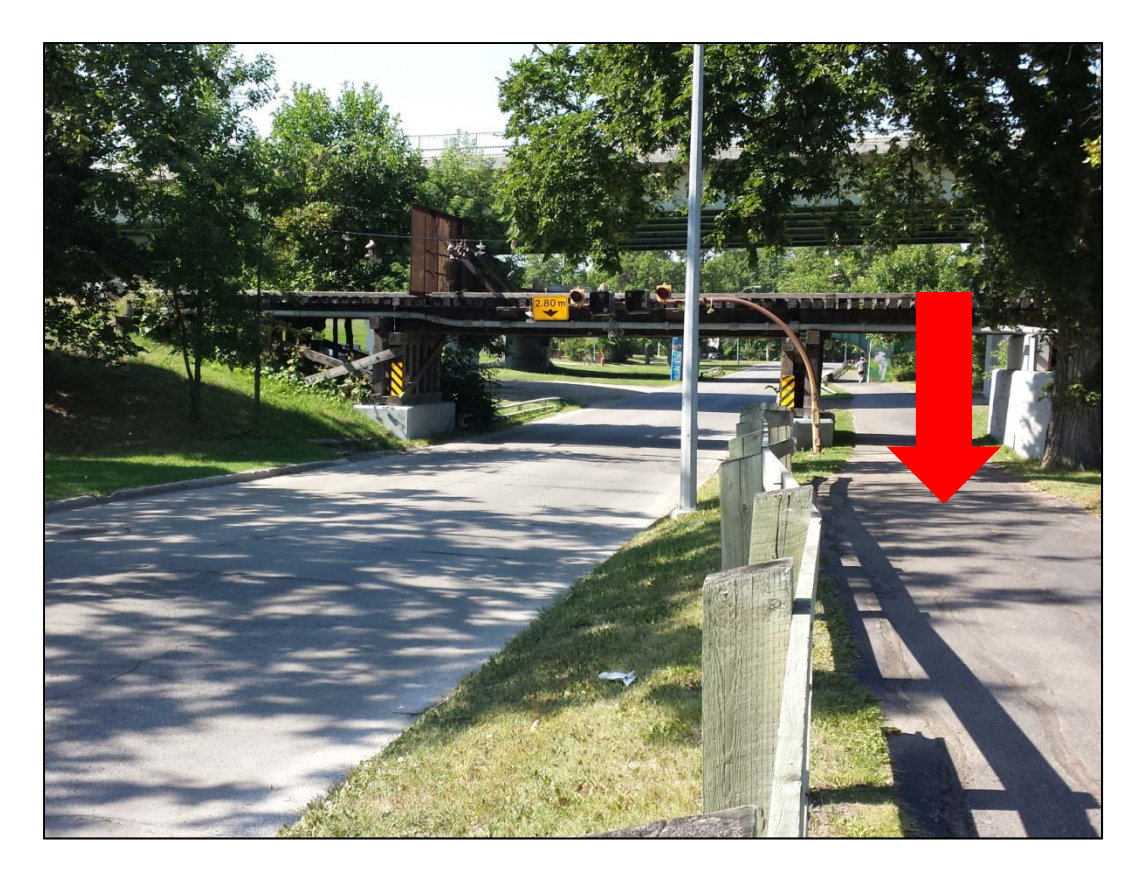
Figure 24 – Site access, facing west.