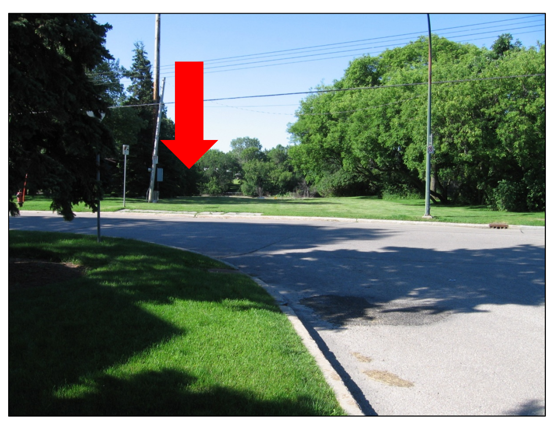
Figure 9 – Site access on Assiniboine Avenue at Rouge Road, facing south.