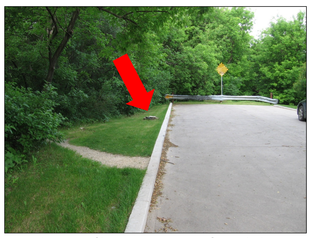
Figure 12 – Site access on Doucet Street, facing west.