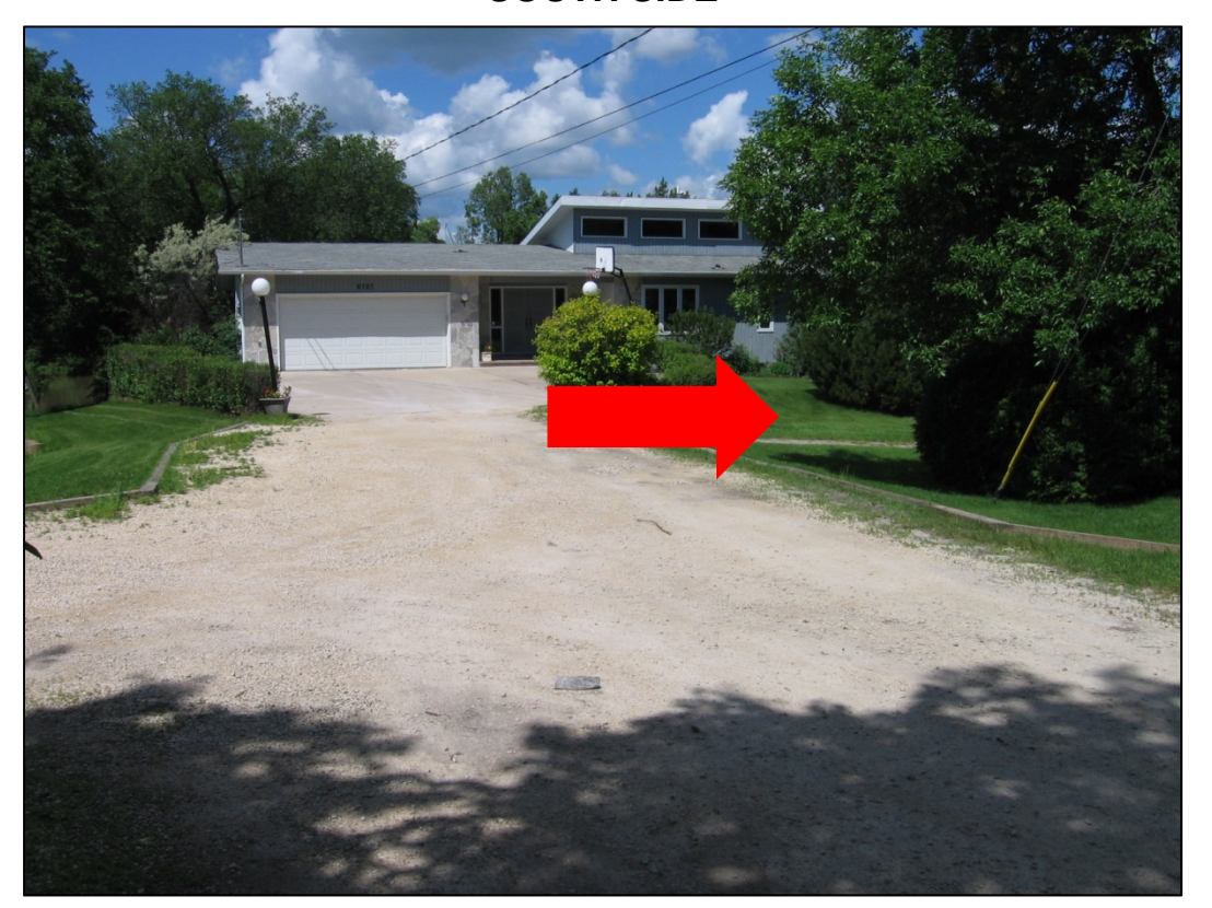
Figure 7 – Site access at corner of Southboine Drive and Berkley Street.