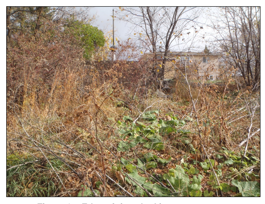
Figure 6 – Edge of river, looking east at pump station.