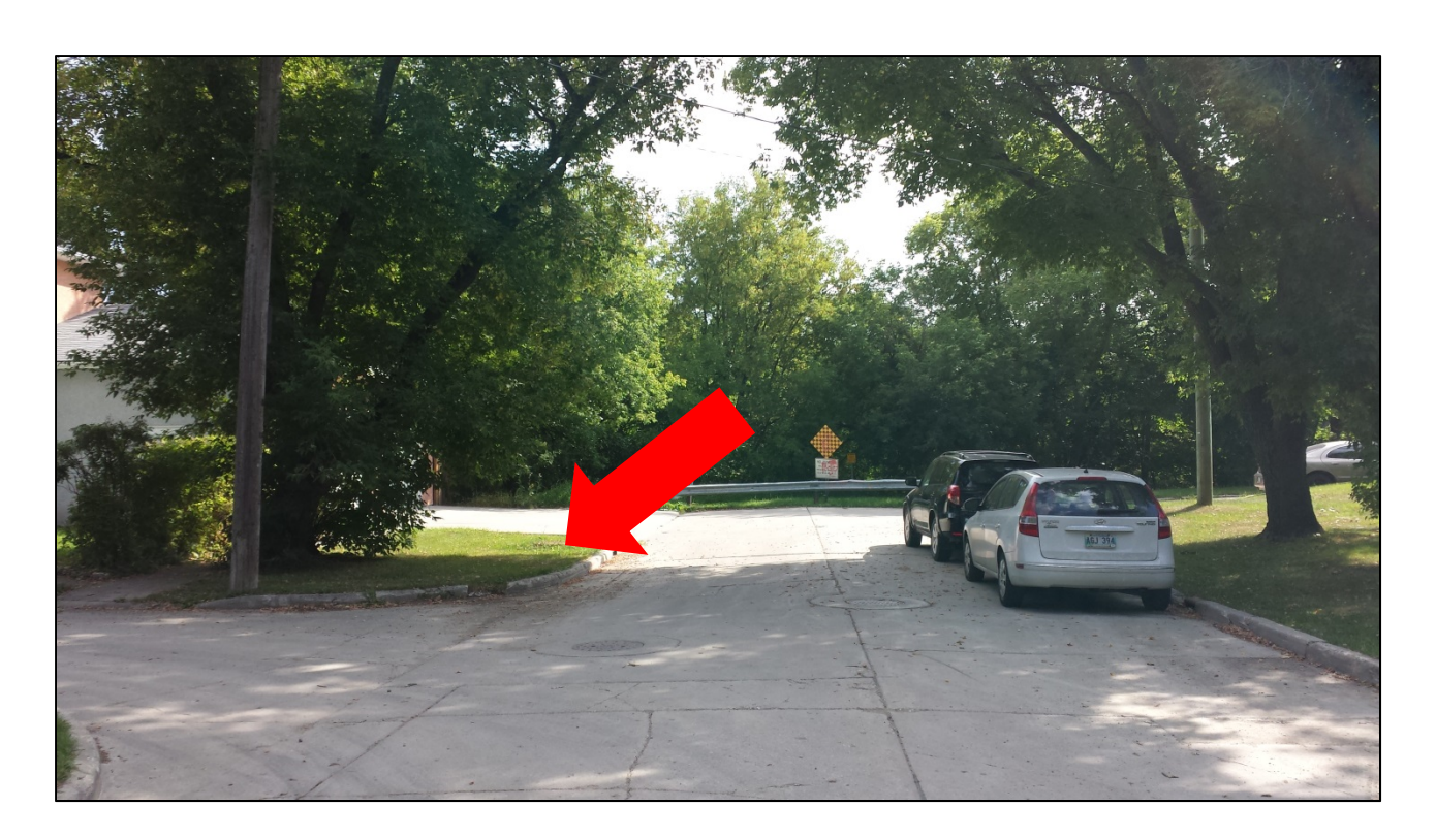
Figure 11 – Site access on Goulet Street, facing east.