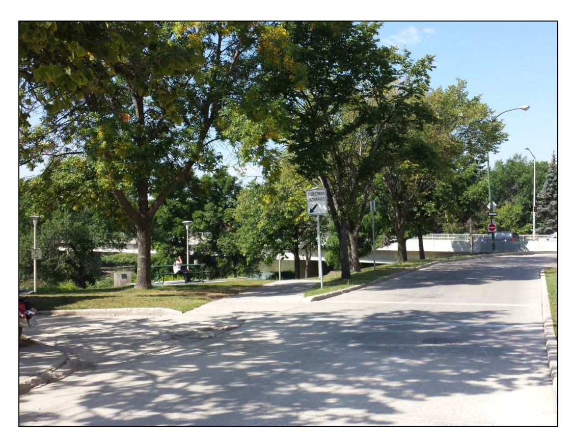
Figure 15 – Site access, facing west.