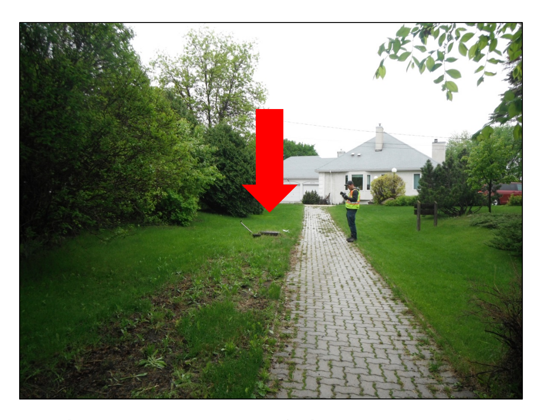
Figure 8 – Valve chamber, facing southwest along feedermain alignment.