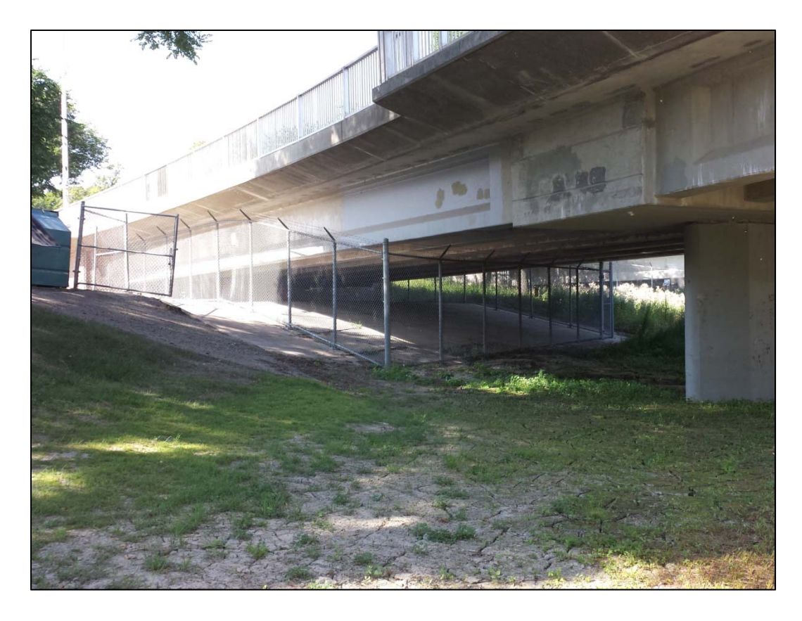
Figure 18 – Site access, facing west.