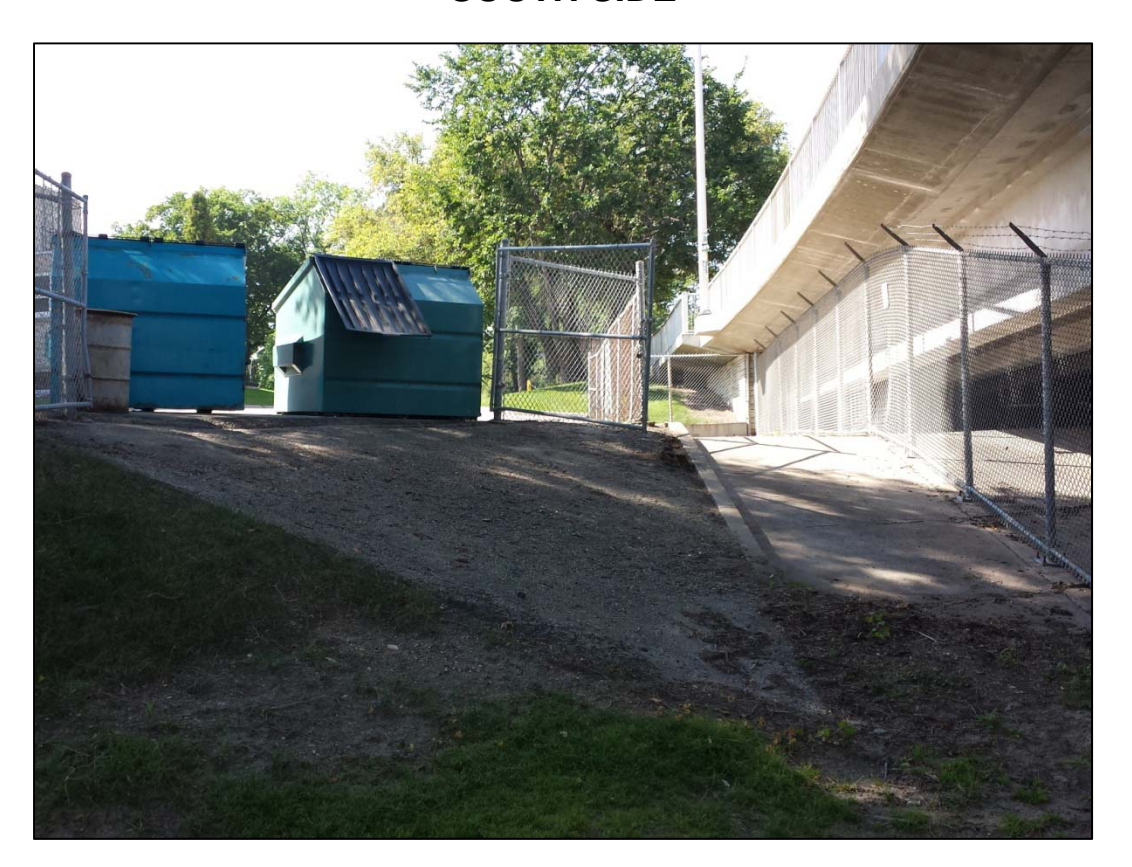
Figure 17 – Site access, facing southwest.