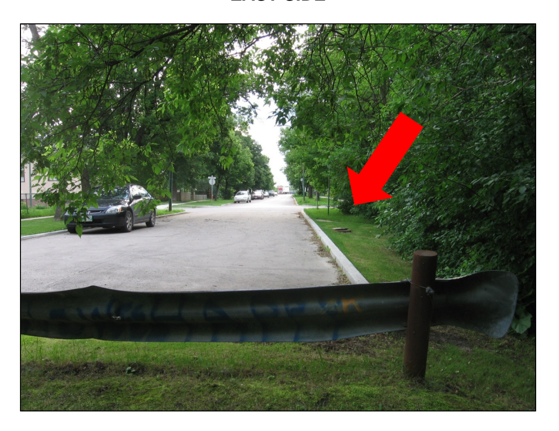
Figure 13 – Site access, facing east.