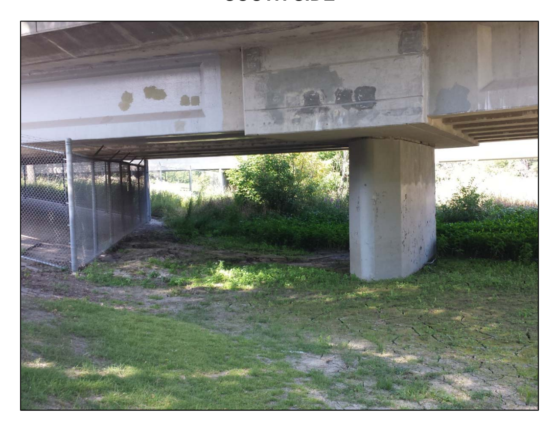
Figure 19 – Site access, facing northwest.