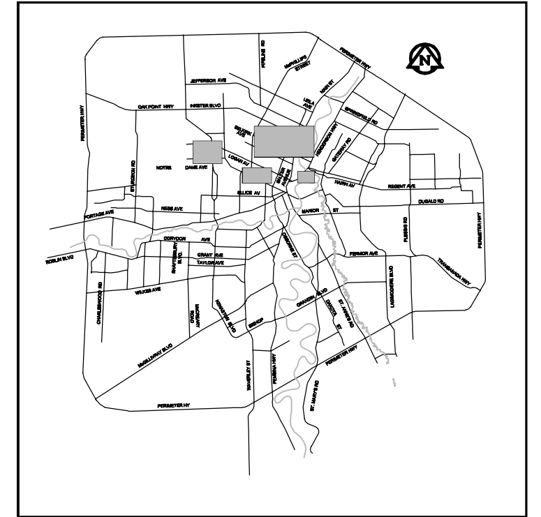
OVERALL LOCATION PLAN