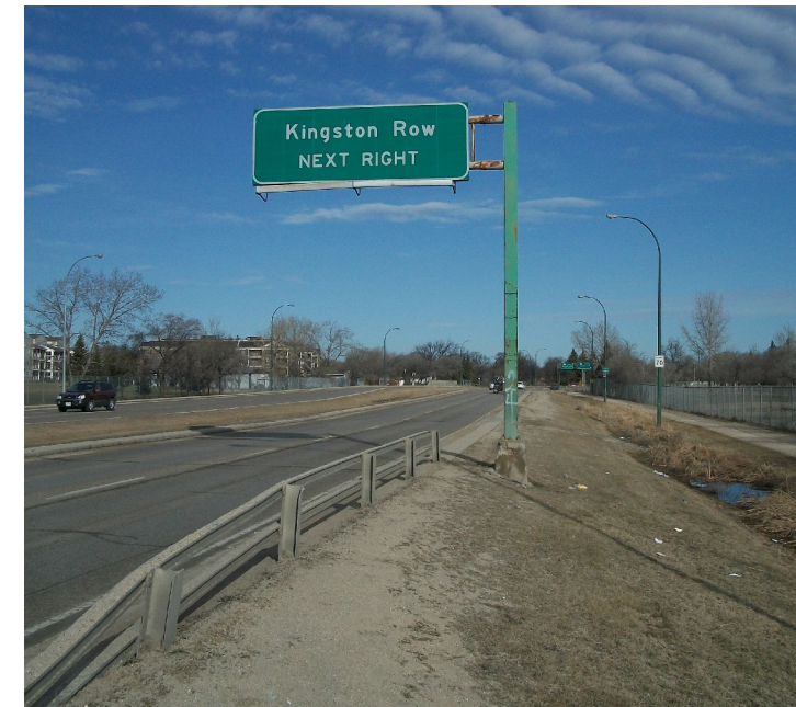
EXISTING S529 STRUCTURE