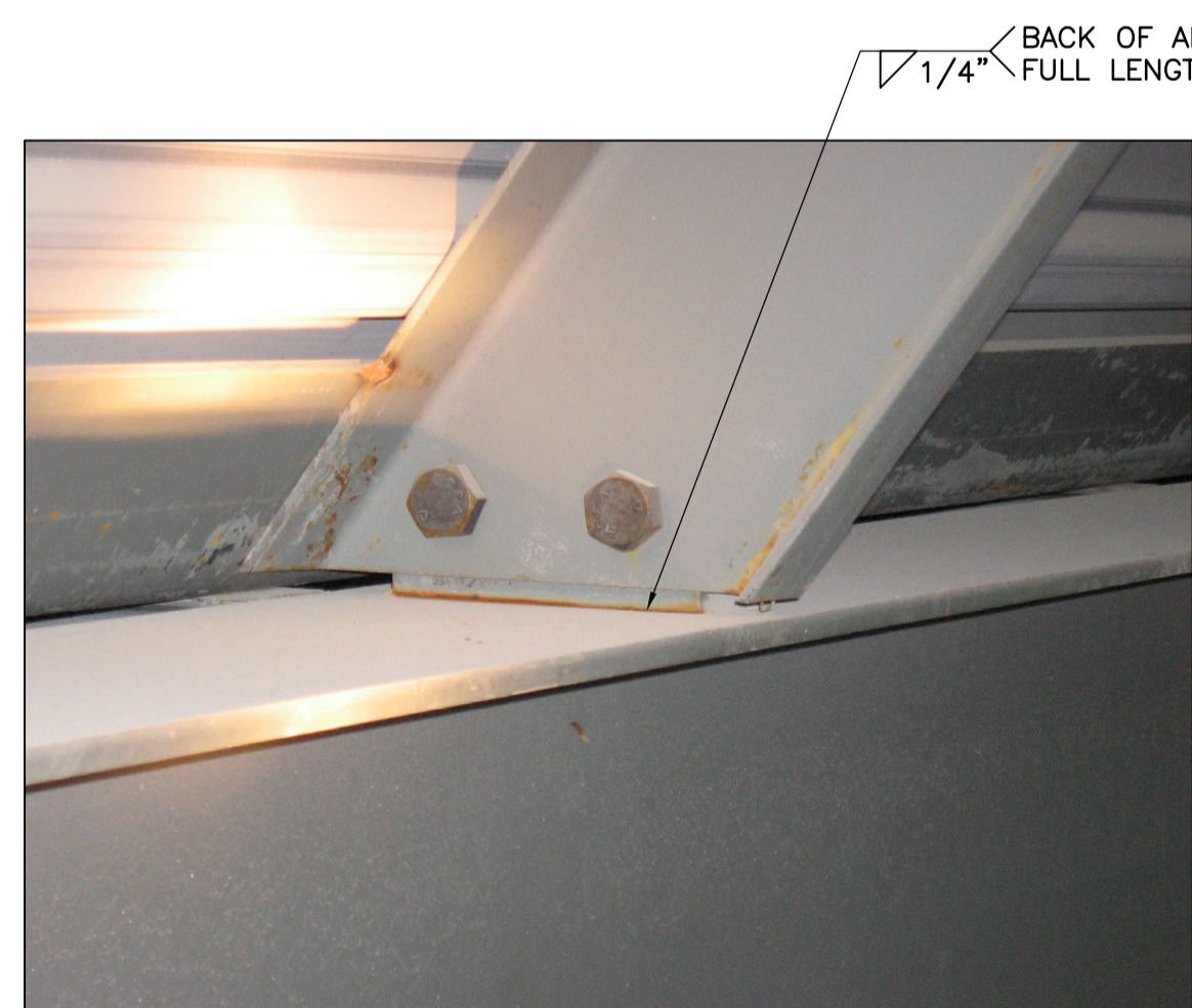
5 EXISTING CHANNEL S02 NTS

NOTE: REMOVE EXISTING DUCT WORK AS REQUIRED, REFER TO MECH.