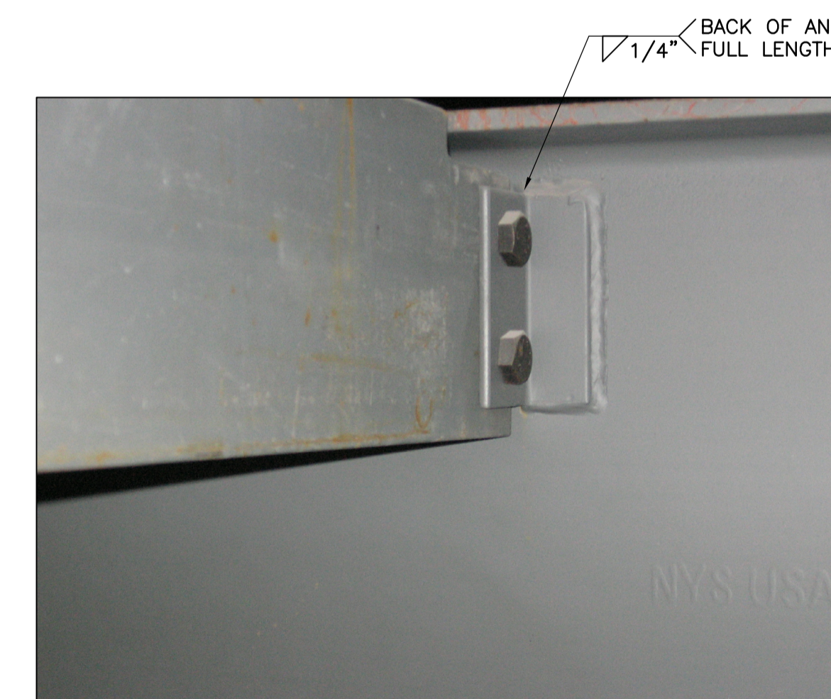
7 EXISTING CHANNEL S02 NTS