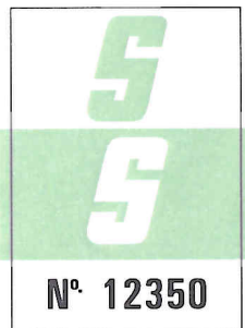
Green = 802