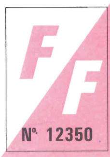
Red = 812