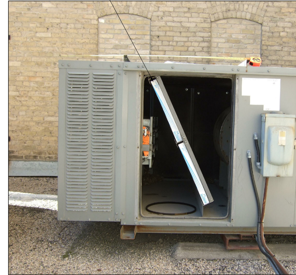
1 EXISTING MAKE-UP AIR UNIT M04 NTS

EXISTING FILTER RACK TO BE RELOCATED AS PER DETAIL BELOW