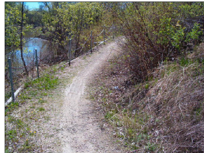
PHOTOGRAPH 7: FACING SOUTH - AT STATION 1+56