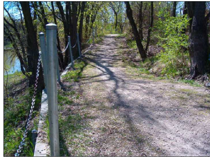
PHOTOGRAPH 2: FACING SOUTH - AT STATION 1+00