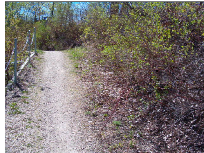
PHOTOGRAPH 8: FACING SOUTH - AT STATION 1+75