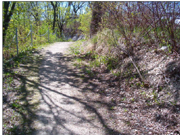
PHOTOGRAPH 4: FACING SOUTH - AT STATION 1+25