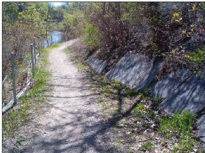
PHOTOGRAPH 6: FACING SOUTH - AT STATION 1+40