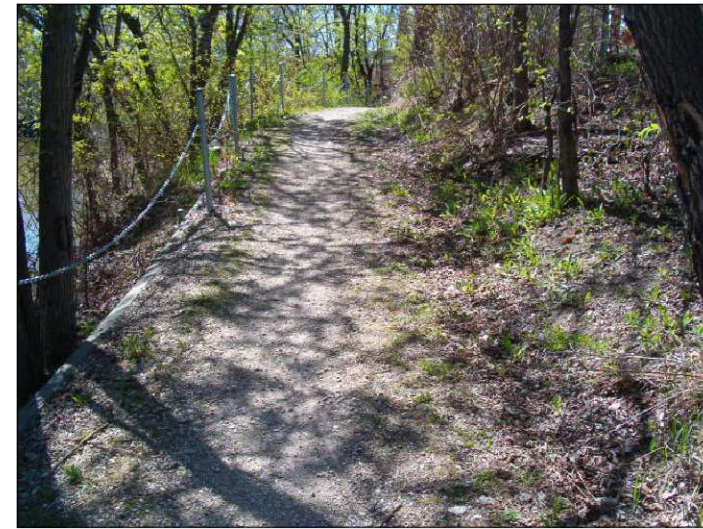
PHOTOGRAPH 3: FACING SOUTH - AT STATION 1+12