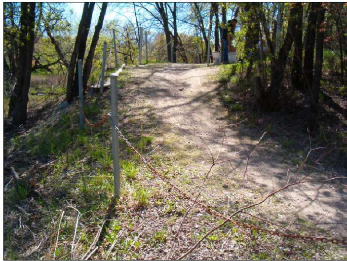
PHOTOGRAPH 1: FACING SOUTH, START OF WALKWAY WALL - AT STATION 0+92