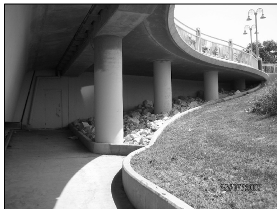
SECTION A NTS