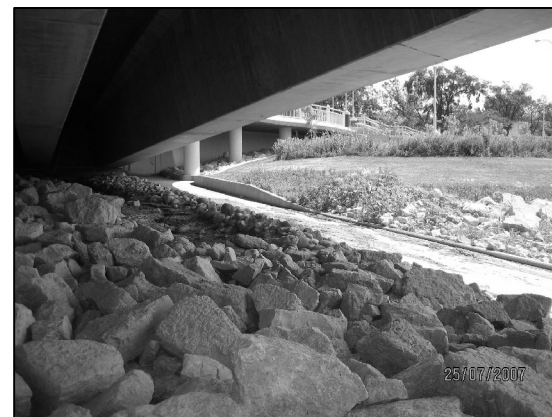
SECTION B NTS