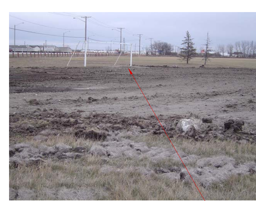
TWO PORTABLE SOCCER GOAL POSTS TO BE RELOCATED TO SIDE OF CONSTRUCTION AREA