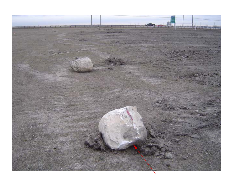
BOULDERS TO BE REMOVED (APPROX. 20)