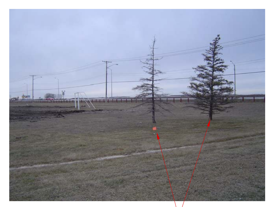
TWO SPRUCE TREES TO BE REMOVED \longrightarrow