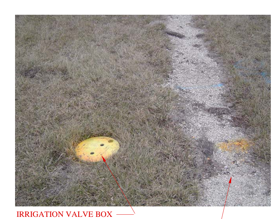
TO BE PROTECTED GRANULAR FRENCH DRAIN TO BE PROTECTED —