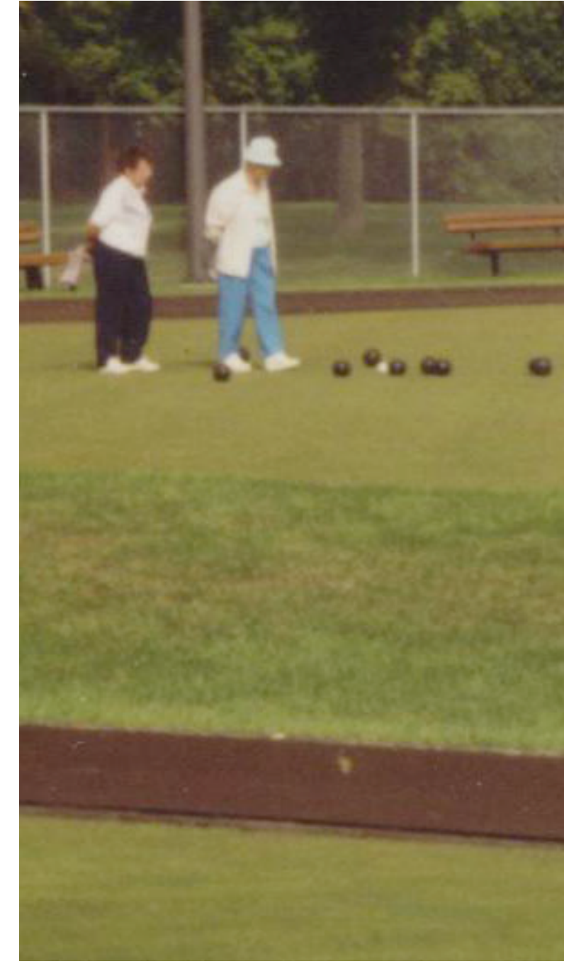
3 Typical Existing Condition L2

NOTE: LOCATION OF UNDERGROUND STRUCTURES AS SHOWN ARE BASED ON THE BEST INFORMATION AVAILABLE BUT NO GUARANTEE IS GIVEN THAT ALL EXISTING UTILITIES ARE SHOWN OR THAT THE GIVEN LOCATIONS ARE EXACT. CONFIRMATION OF EXISTENCE AND EXACT LOCATION OF ALL SERVICES MUST BE OBTAINED FROM THE INDIVIDUAL UTILITIES BEFORE PROCEEDING WITH CONSTRUCTION.