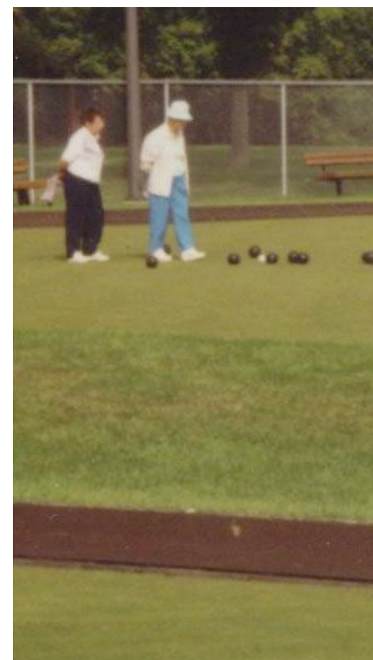
3 Typical Existing Condition