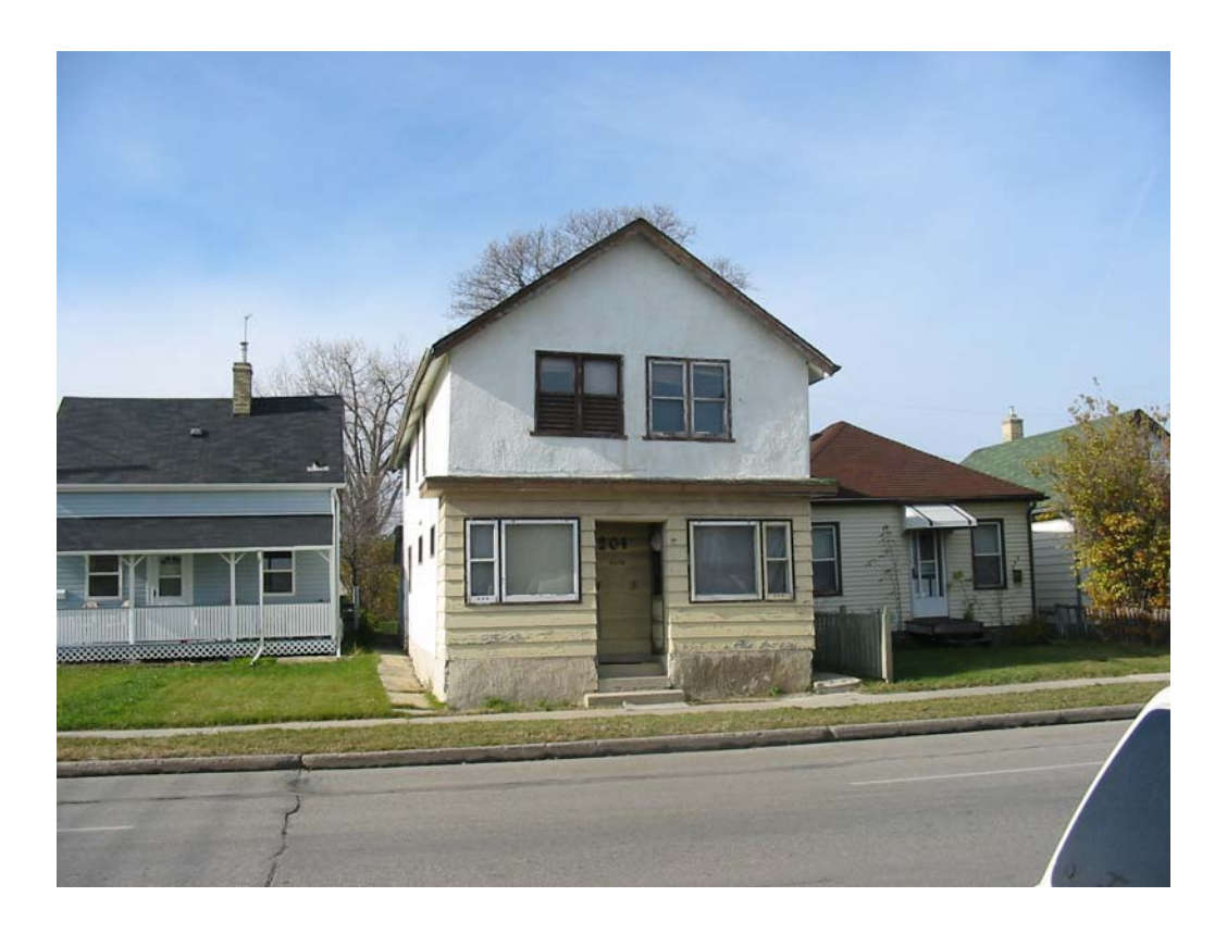
204 Queen St.