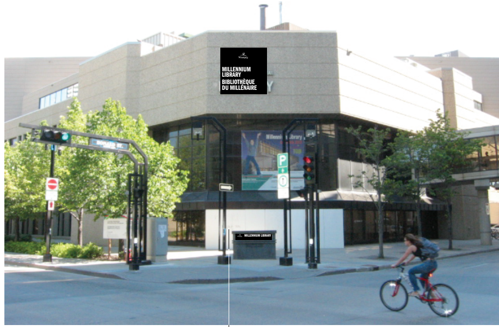
X.1 Type A.16 SF