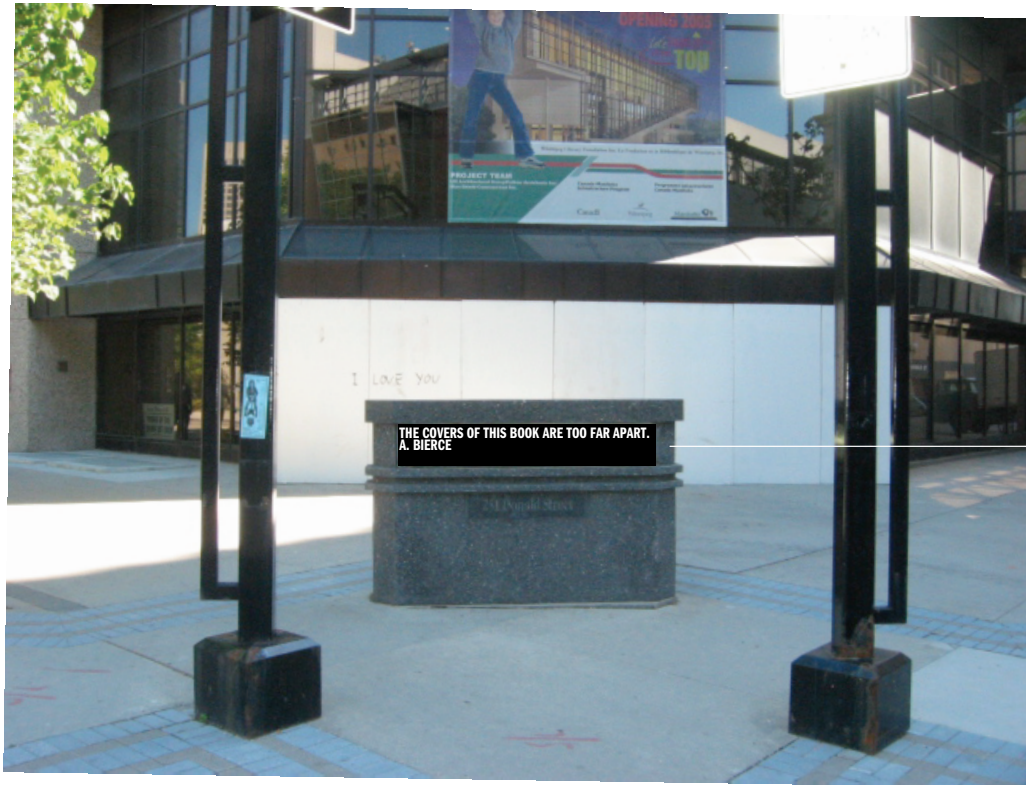
X.1 Type A.14 SF: 11"± x 10' x 10' Sign Pro self-hinged flexible vinyl frameless face or sim. 20 oz. translucent white vinyl face w/right-reading white graphics reversed out of opaque, matte black, ground; 2nd 'black out' layer to obtain opacity. Additionally reinforce frame w/braces. Paint SignPro #850 frame matte black. Paint inside of cabinet white. All electrics (to -40°). 120v power supply by others; el. hookup by this contractor. Remove and dispose of existing illuminated sign. Provide shop dwg. at a large scale. Obtain permit(s) as req'd.