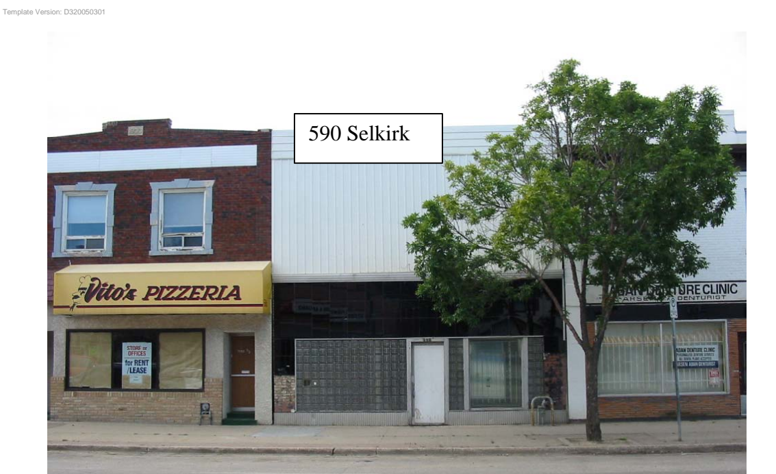
590 Selkirk Ave.