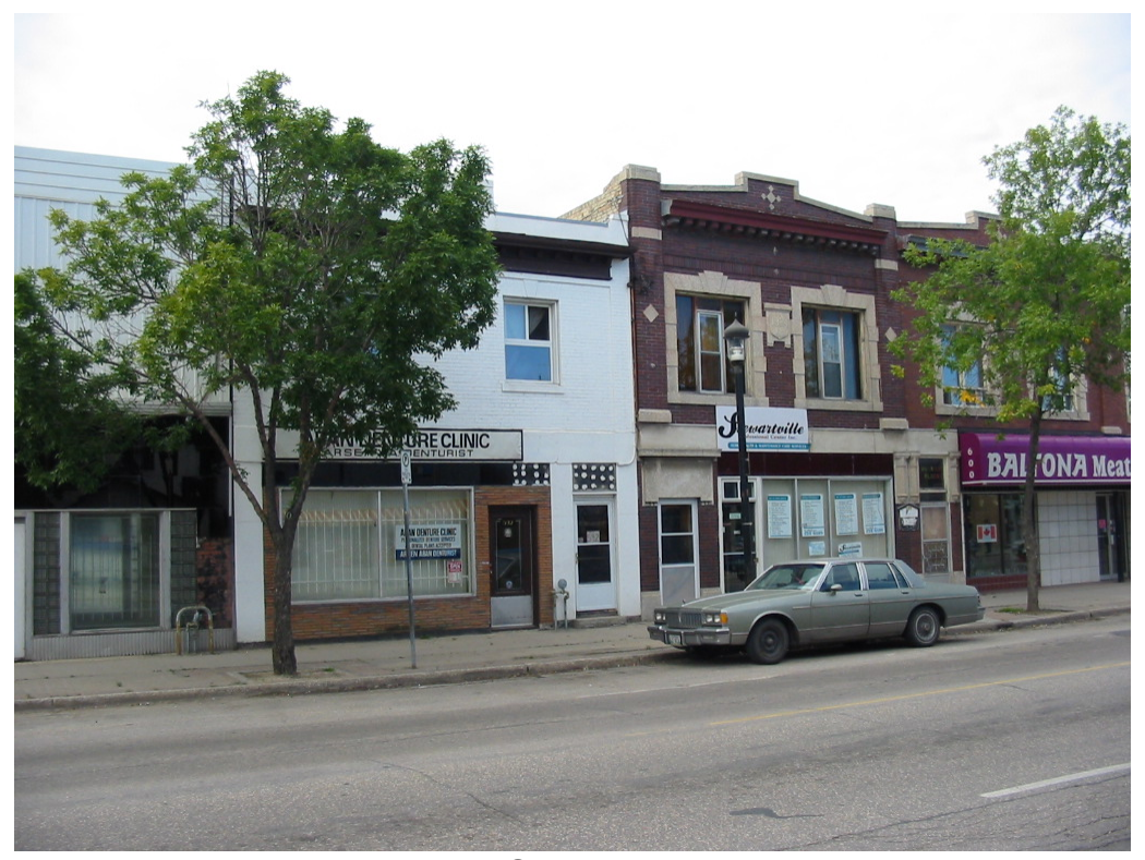
590 Selkirk Ave.