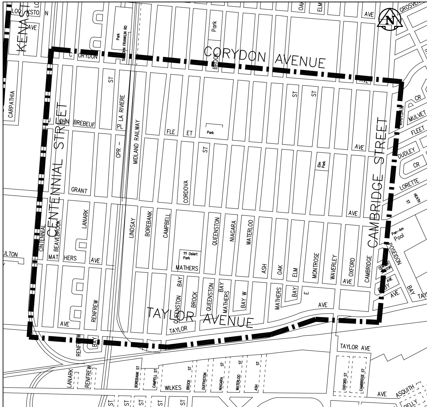
SOUTH AREA - AREA 1 CORYDON AVENUE TO TAYLOR AVENUE CENTENNIAL STREET TO CAMBRIDGE STREET