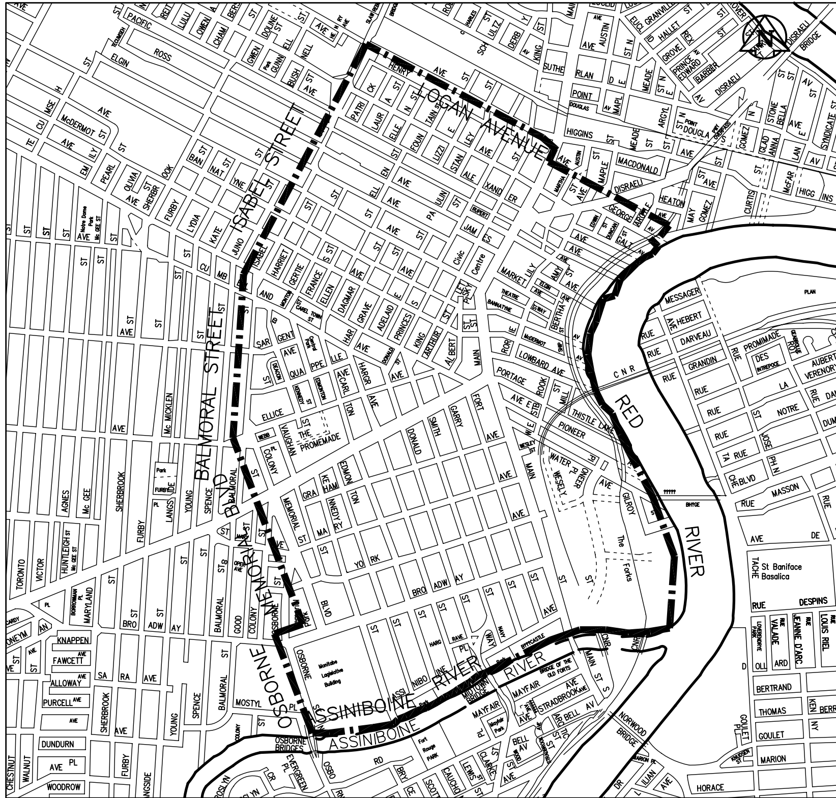
NORTH AREA – AREA 1 HENRY AVENUE TO ASSINIBOINE RIVER ISABEL STREET/OSBORNE STREET TO THE RED RIVER