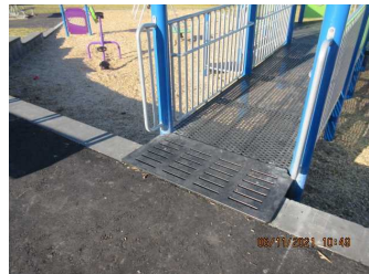
Retaining Wall w/ Ramp