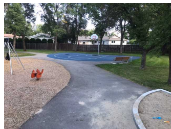
Rolled Accessible Entry