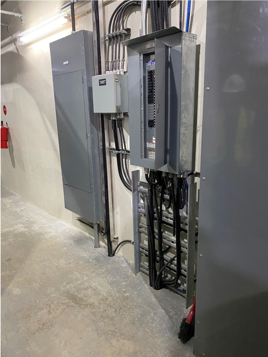
Figure 13: Existing Panel PP-D30 Cable Tray