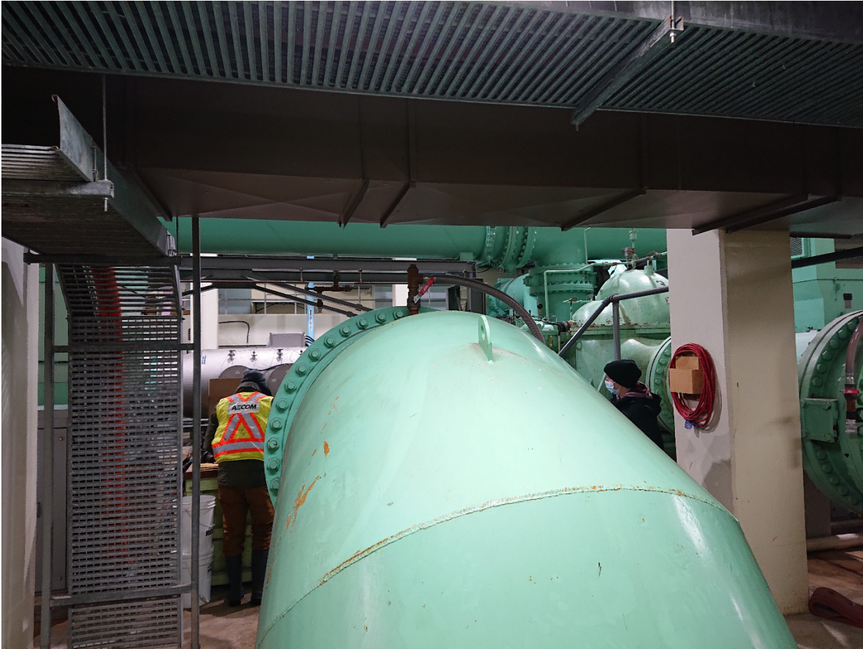
Figure 4: View of Work Area at Pipe Bend Reducer Facing South