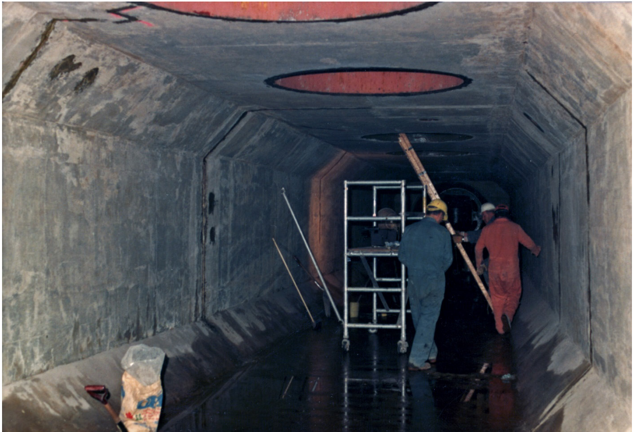
Figure 17: Suction Header Photo 2 circa 1995