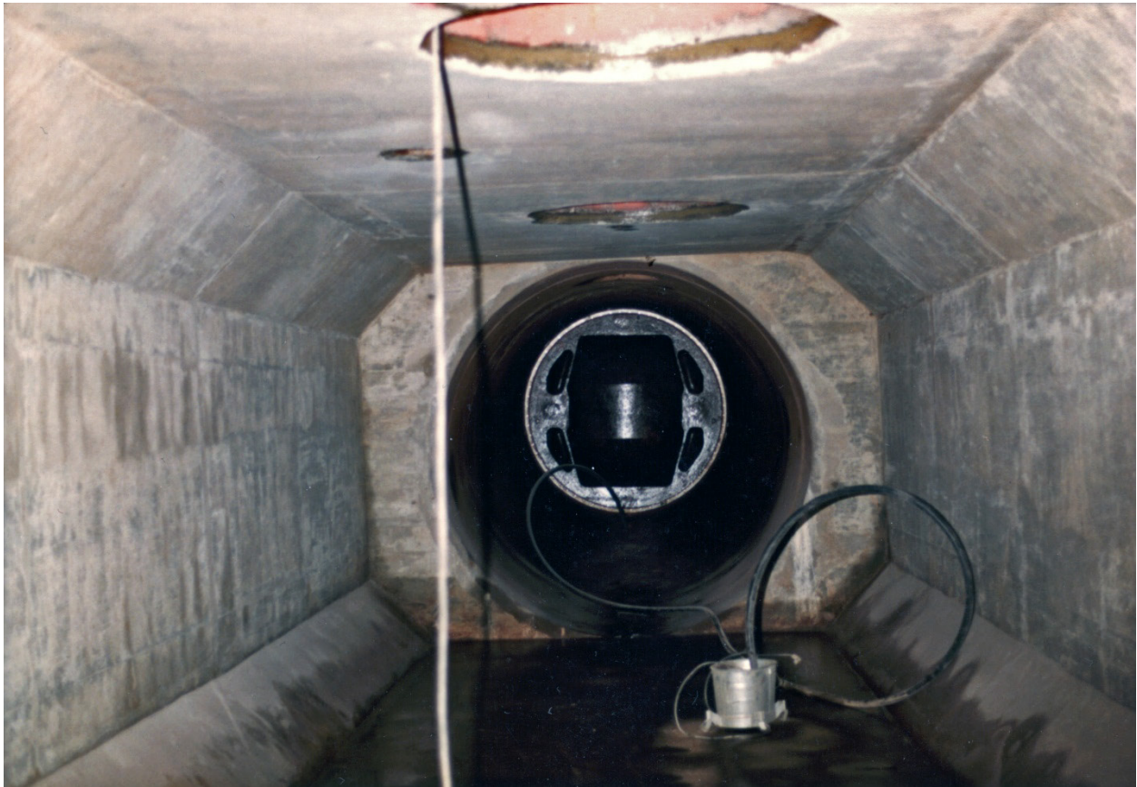
Figure 16: Suction Header Photo 1 circa 1995