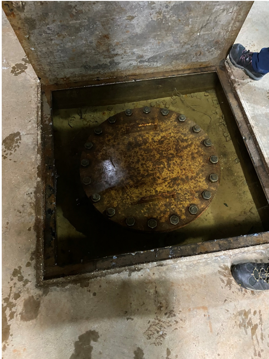
Figure 15: East site 610 mm Access Blind Flange