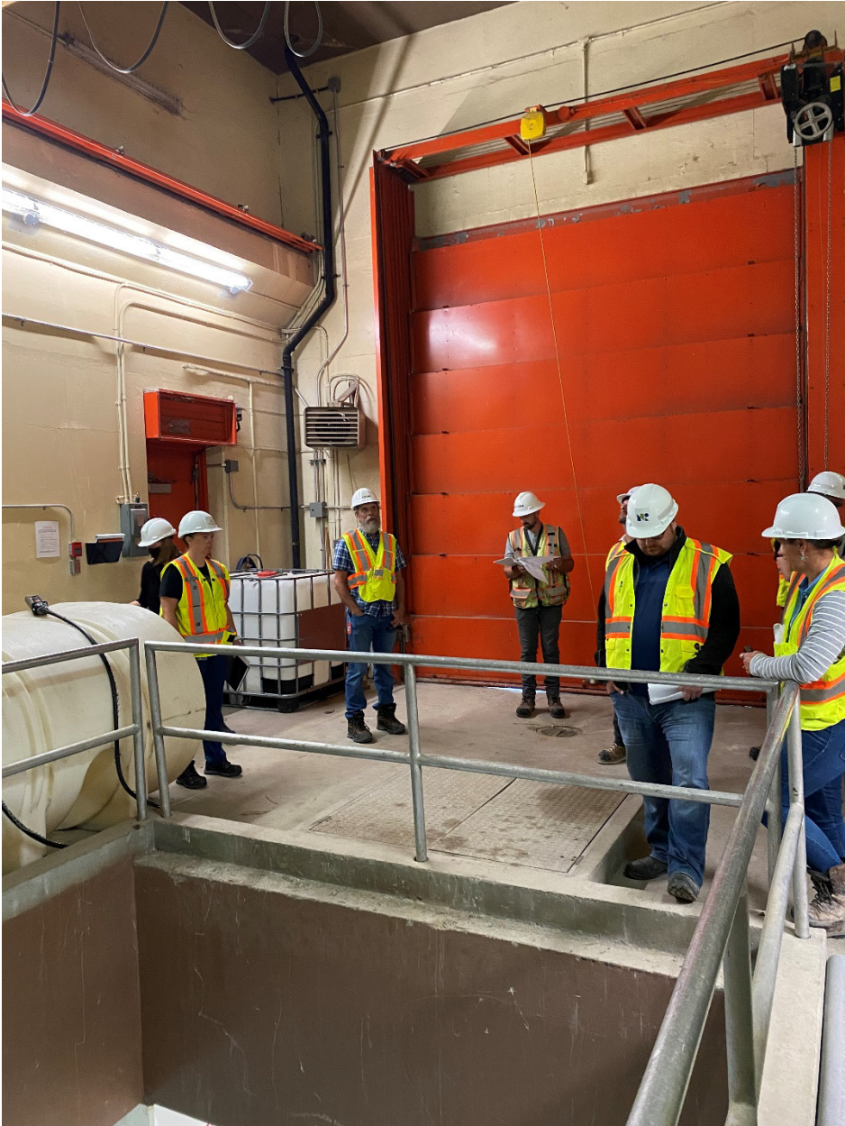
Figure 8: Garage Door