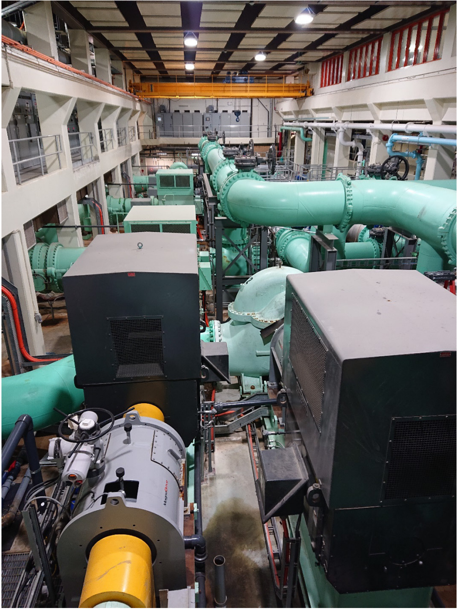
Figure 1: View from West Side of Deacon Pump Floor