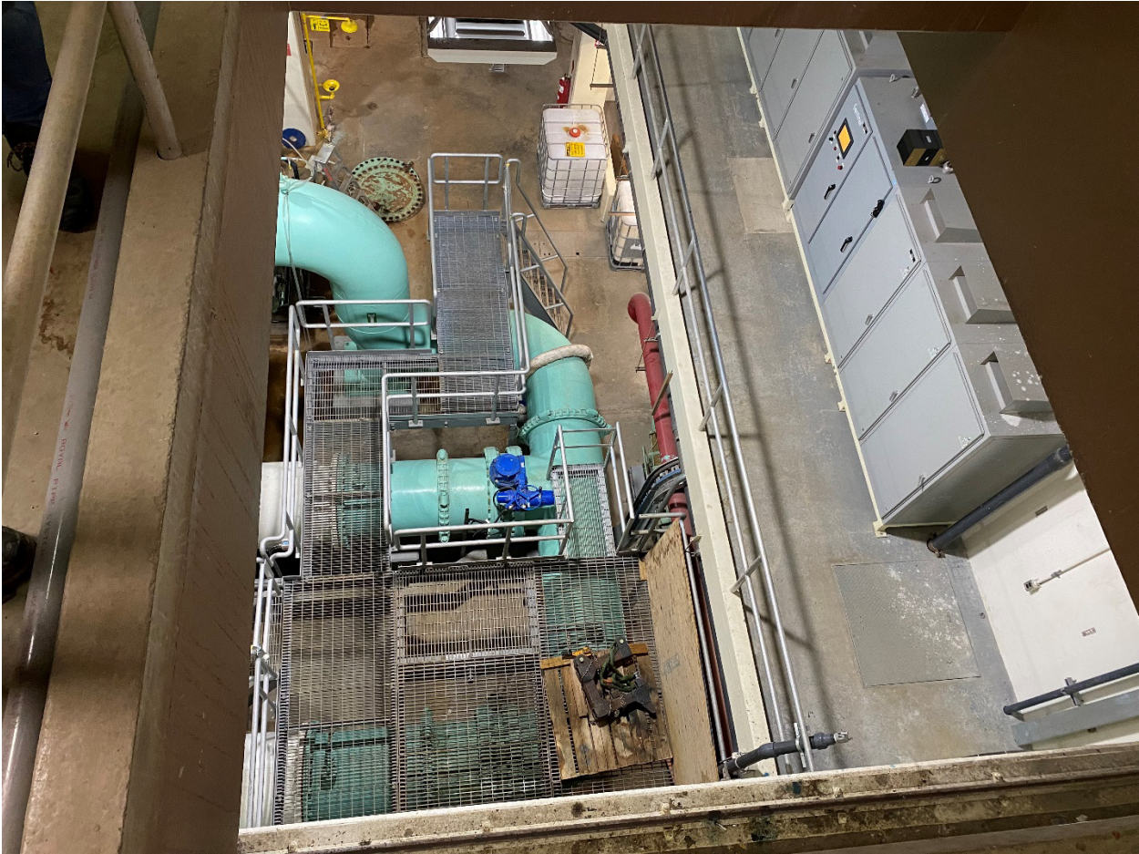
Figure 7 View from Garage Entry Access to Platform on Pump Station Floor below