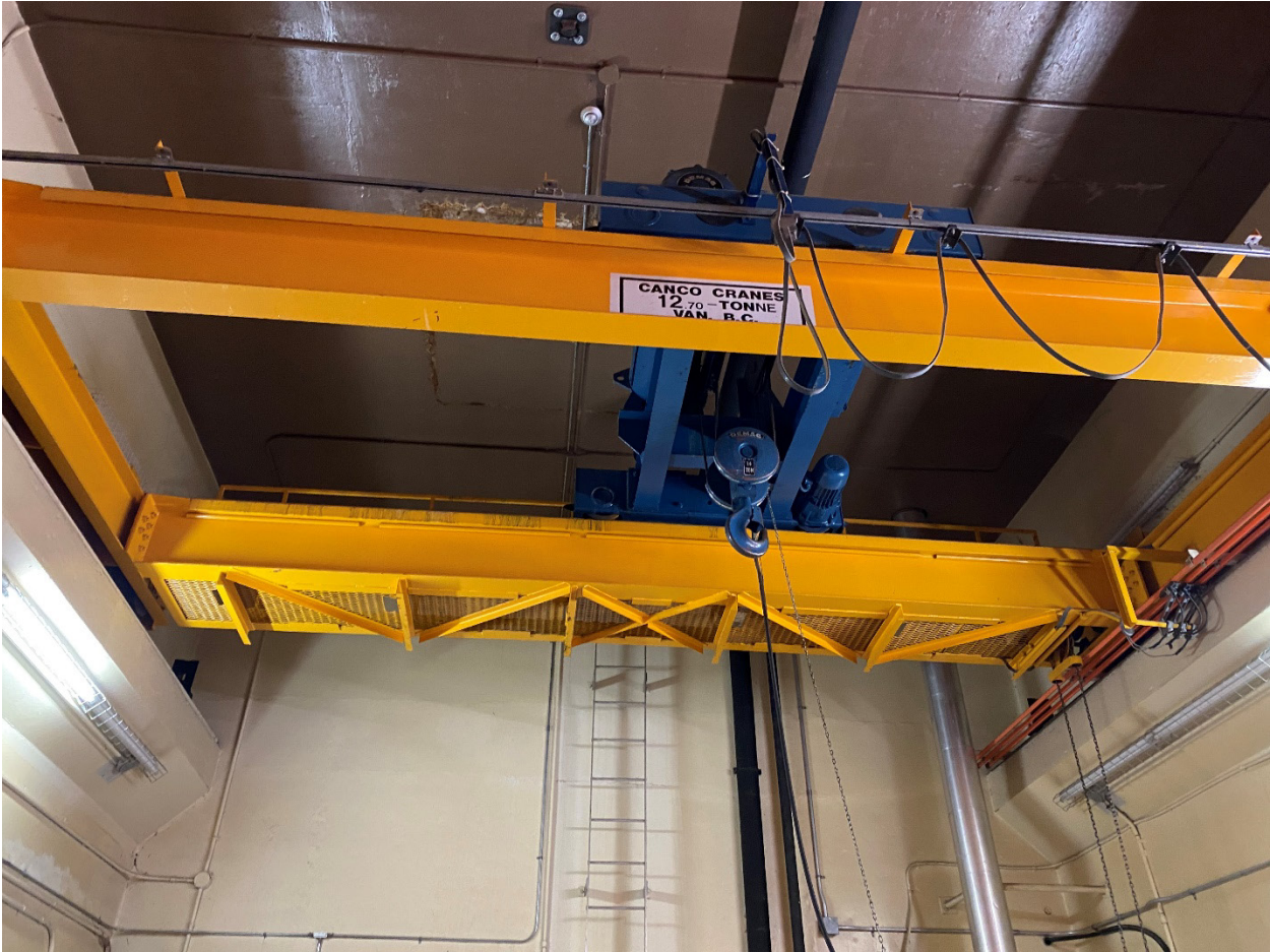
Figure 5: Garage Entry Gantry Crane