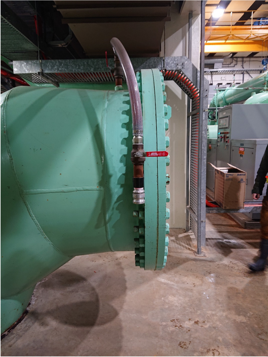
Figure 2: View of Pipe Bend Reducer and Blind Flange to be Removed