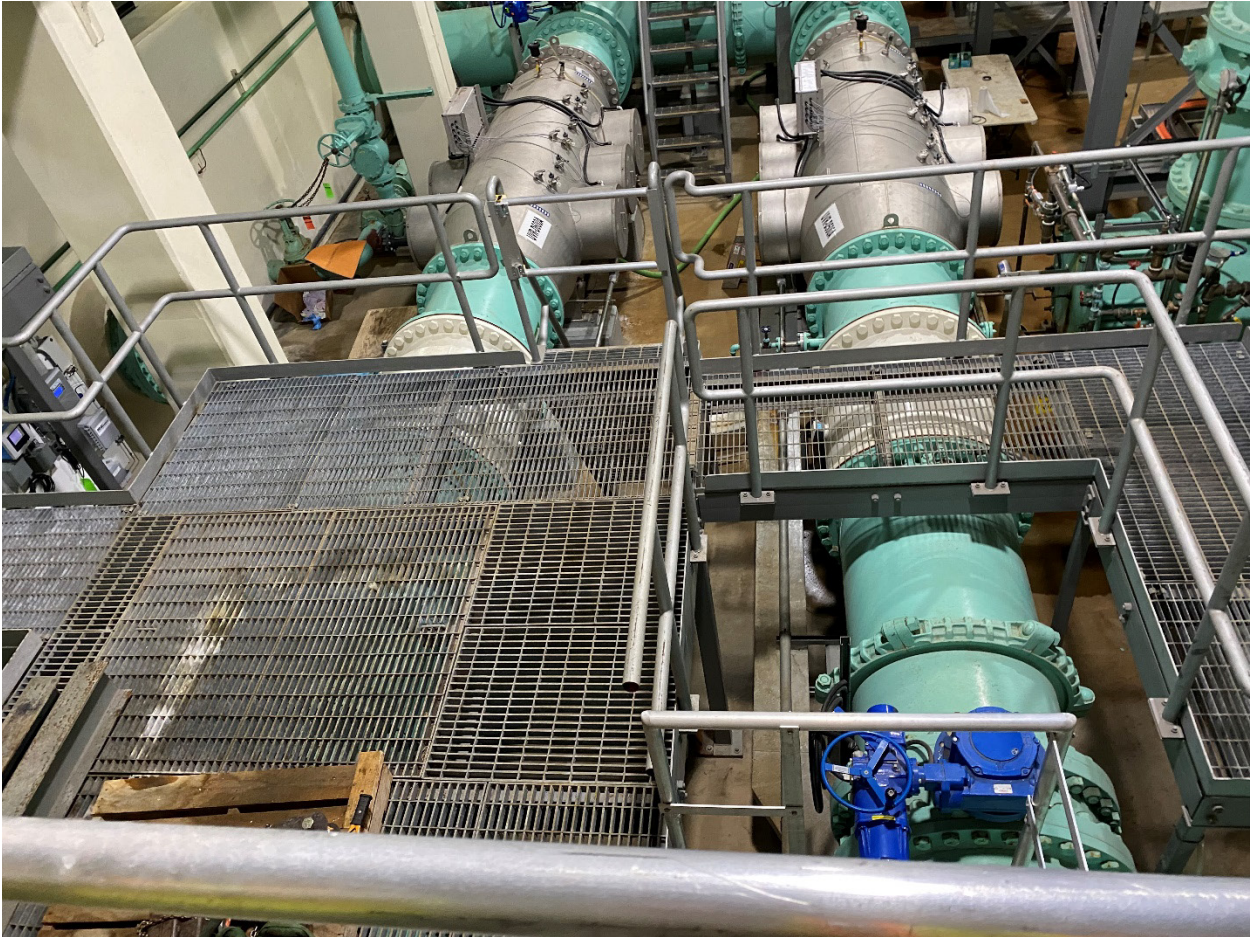
Figure 10: Pump Station Floor Platform below Garage Access