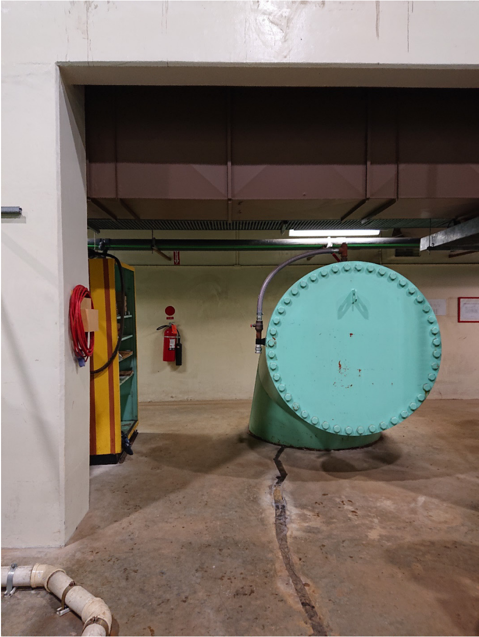
Figure 3: View of Work Area at Pipe Bend Reducer Facing North