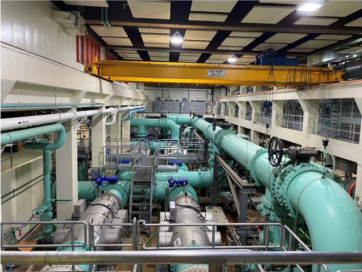
Figure 11: View from East Side of Deacon Pump Floor