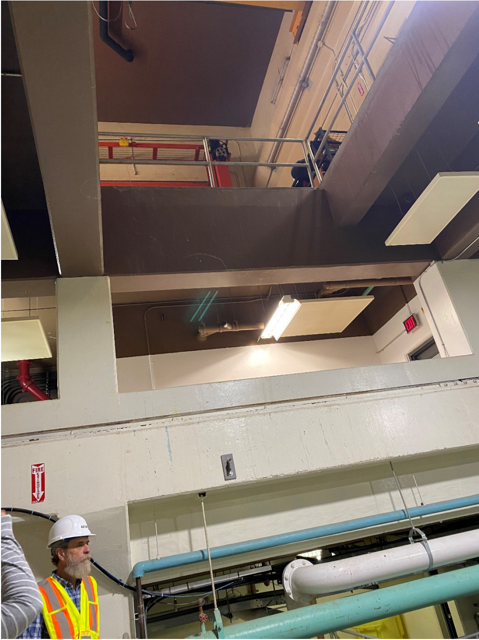
Figure 9: View from Pump Station Walkway to Garage Access (above)