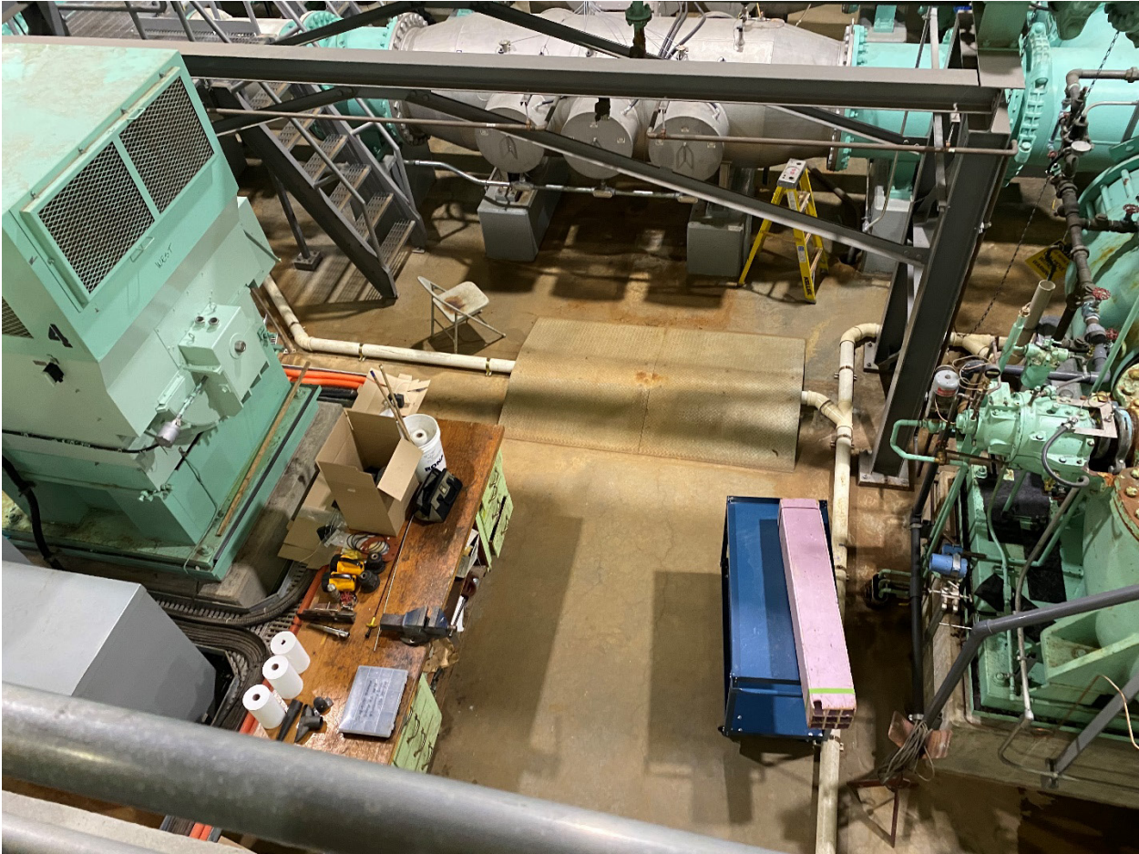
Figure 14: View down to location south of blinded intake piping bend