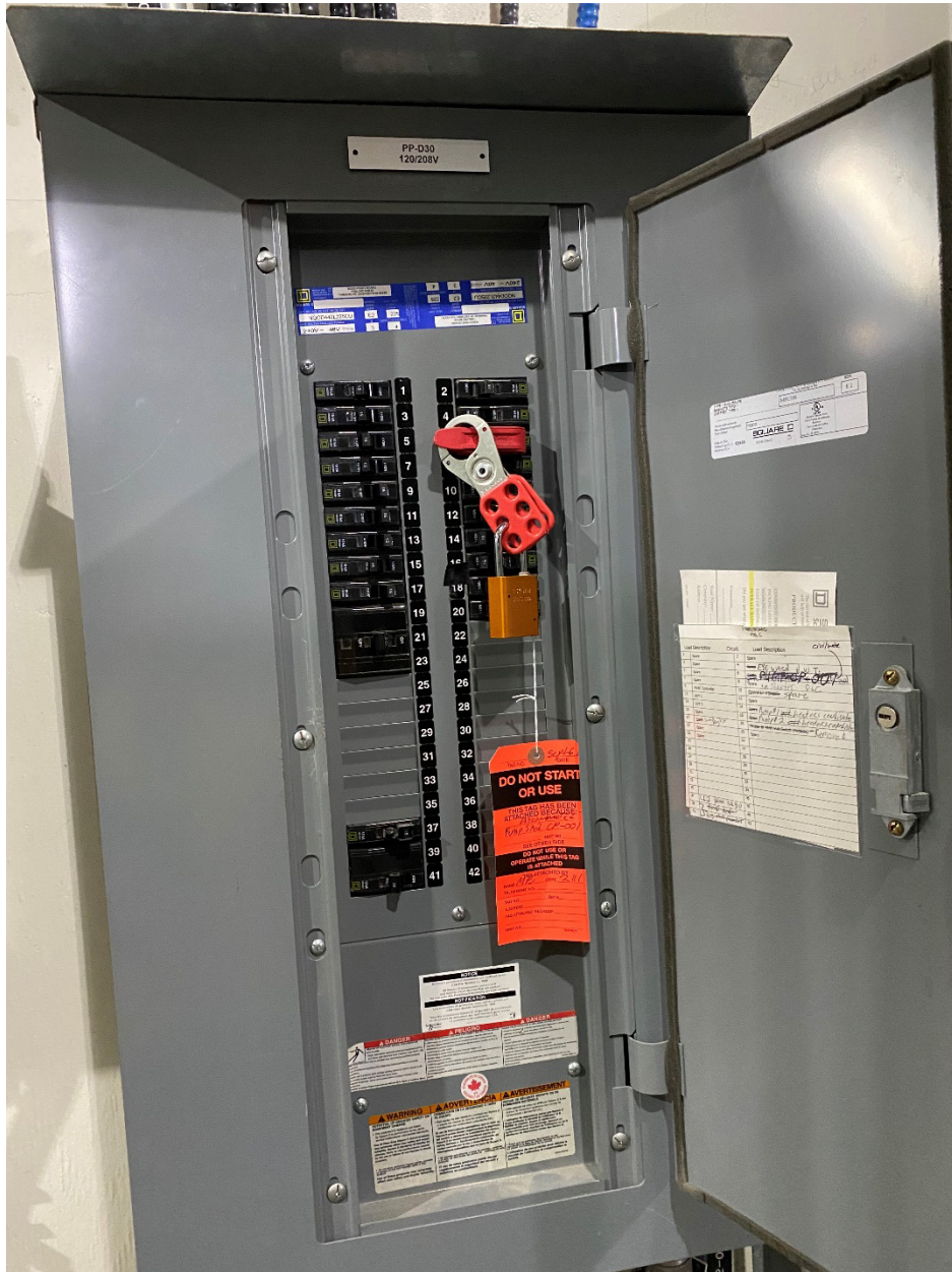
Figure 12: Existing Panel PP-D30