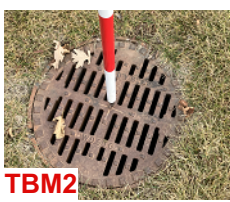
TBM2: Top of North Catch Basin: 99.792