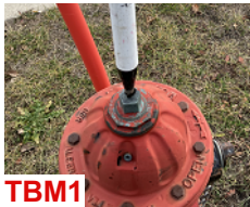
TBM1: Top of Fire Hydrant: 101.601