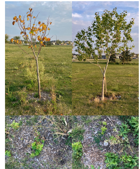
Existing condition of trees (2) and rootballs (6) to be removed