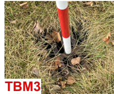
TBM3: Top of East Catch Basin: 98.983

CONTRACTOR TO CONFIRM ALL DIMENSIONS AND REPORT ANY DISCREPANCIES TO CONTRACT ADMINISTRATOR PRIOR TO CONSTRUCTION. LOCATION OF UNDERGROUND STRUCTURES AS SHOWN ARE BASED ON THE BEST INFORMATION AVAILABLE BUT NO GUARANTEE IS GIVEN THAT ALL EXISTING UTILITIES ARE SHOWN OR THAT THE GIVEN LOCATIONS ARE EXACT. CONFIRMATION OF EXISTENCE AND EXACT LOCATION OF ALL SERVICES MUST BE OBTAINED FROM THE INDIVIDUAL UTILITIES BEFORE PROCEEDING WITH CONSTRUCTION.