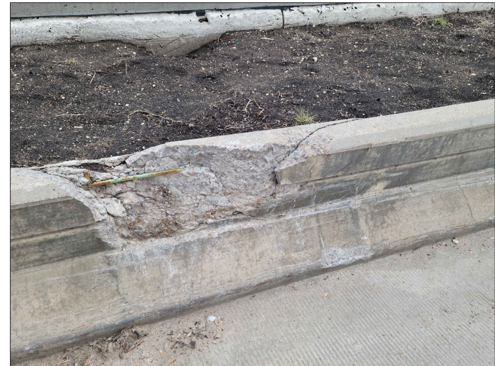
PHOTO 1 - PRECAST PLANTER WALL REPAIR AREA