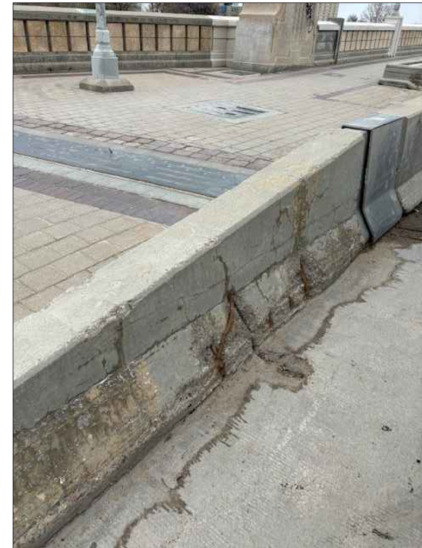
PHOTO 2 - NE CONCRETE BARRIER REPAIR AREA

ENGINEERS GEOLOGISTS MANITOBA Certificate of Authorization MORRISON HERSHFIELD No. 1736