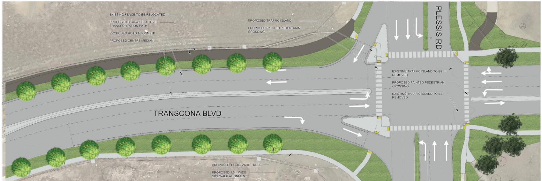
ENLARGEMENT AREA 2