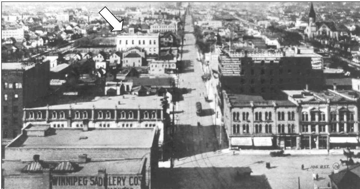
Plate 6 – Looking west down William Avenue, ca.1912, Carnegie Library at arrow.