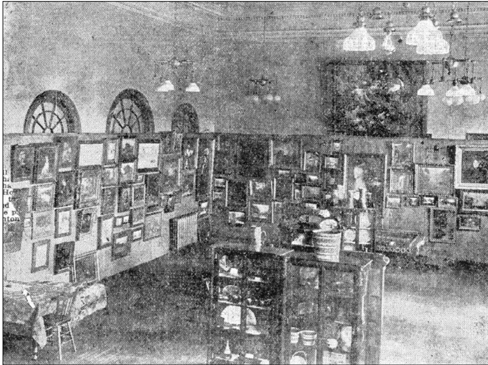
Plate 5 – A view of the second floor interior, 1912.