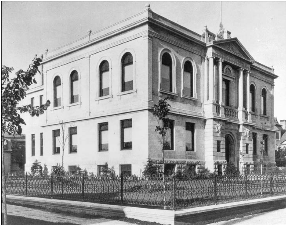
Plate 2 - Another shot from this period, ca.1905.