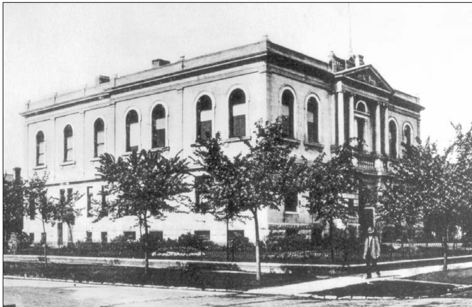
Plate 4 – Carnegie Library shortly after its addition, ca.1910.