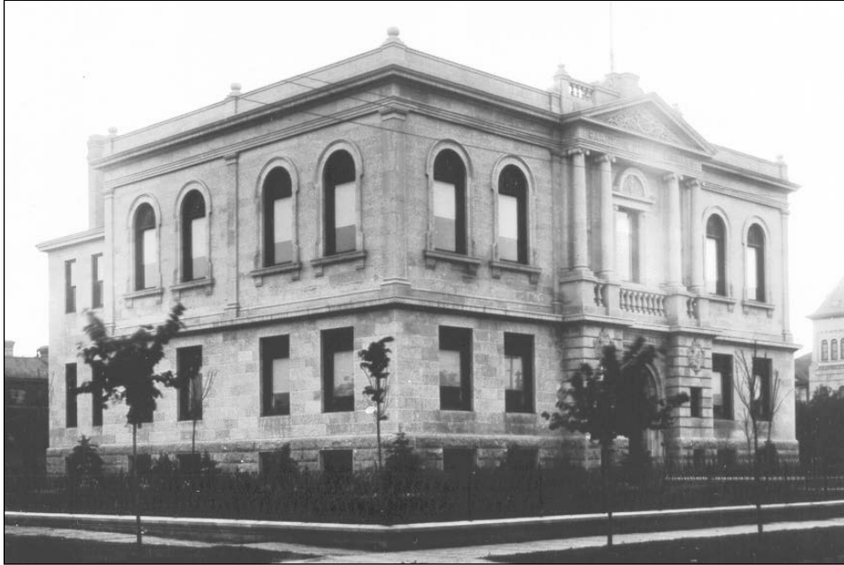
Plate 1 – Carnegie Library, 380 William Avenue shortly after its completion, ca.1905.