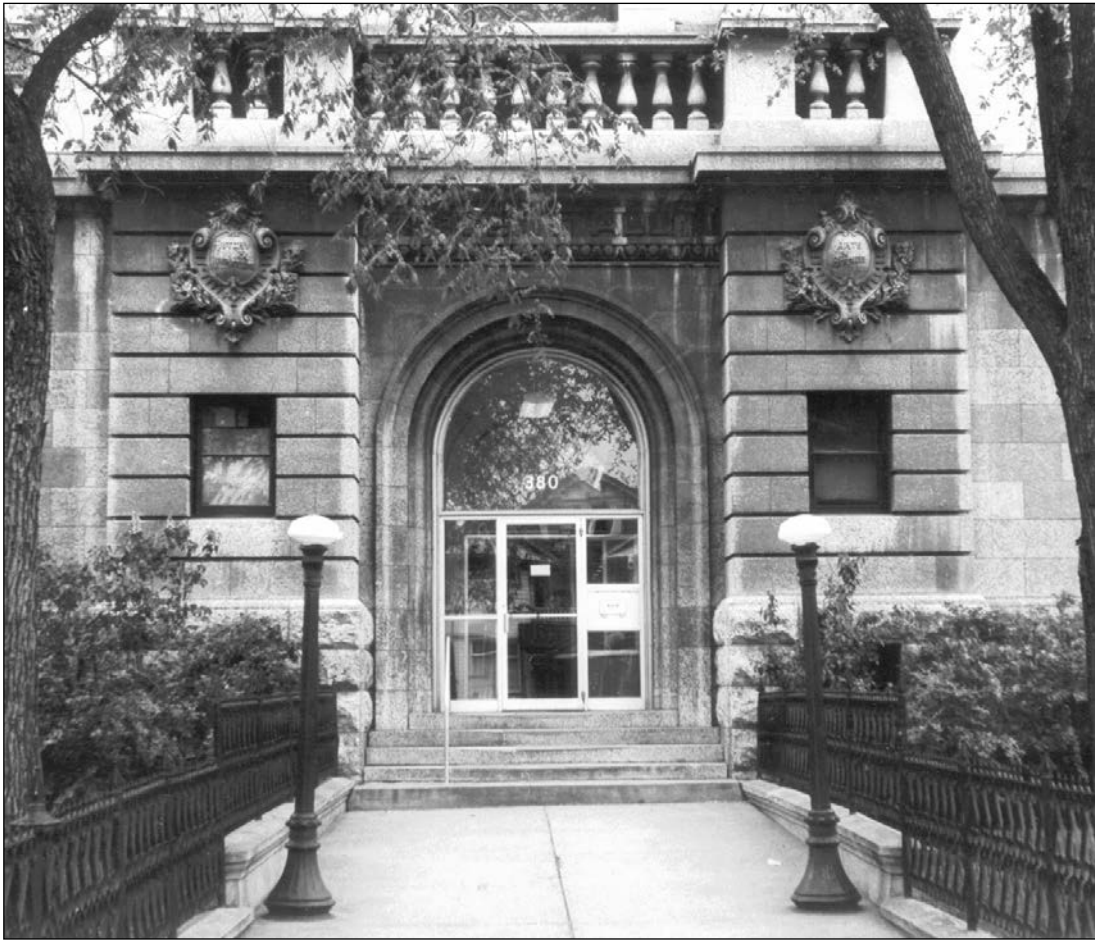
Plate 7 – Front entrance, 1969.