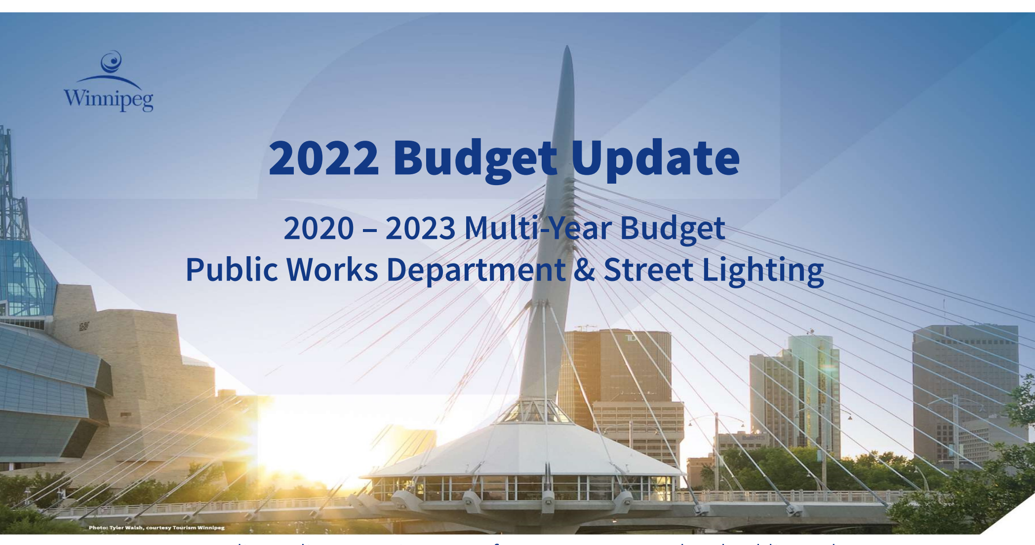
Standing Policy Committee on Infrastructure Renewal and Public Works December 4, 2021