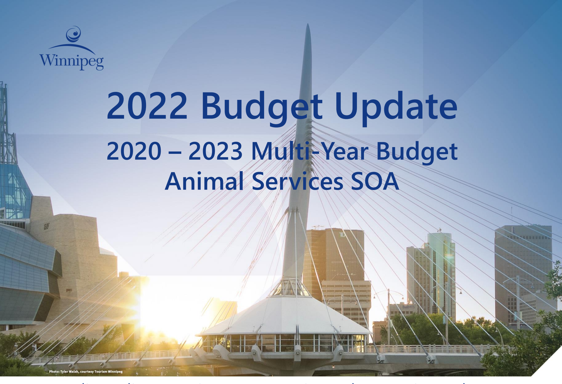
Standing Policy Committee on Innovation and Economic Development November 29, 2021